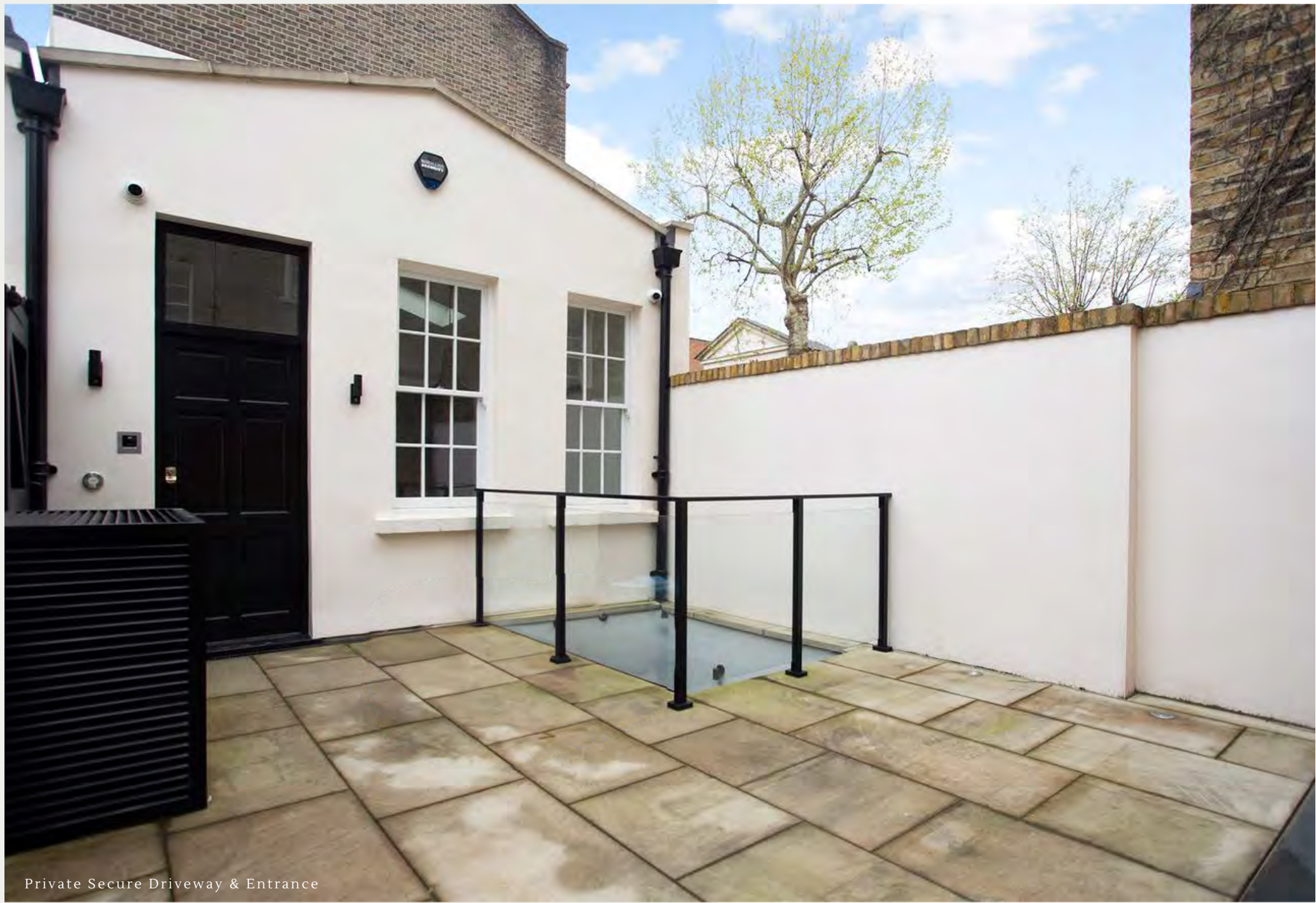
Private Secure Driveway & Entrance