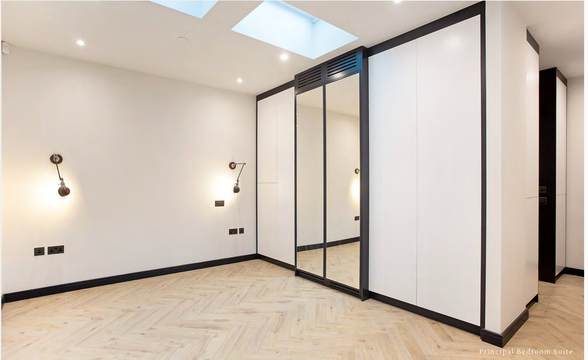
Principal Bedroom Suite

The basement level also offers access to a private patio—a serene retreat bathed in natural light. Each bedroom is complete with plenty of built in storage and due to the light well and cleverly designed architecture, are flooded with natural light. Additionally, the property boasts private gated parking, a rare feature for the neighbourhood.