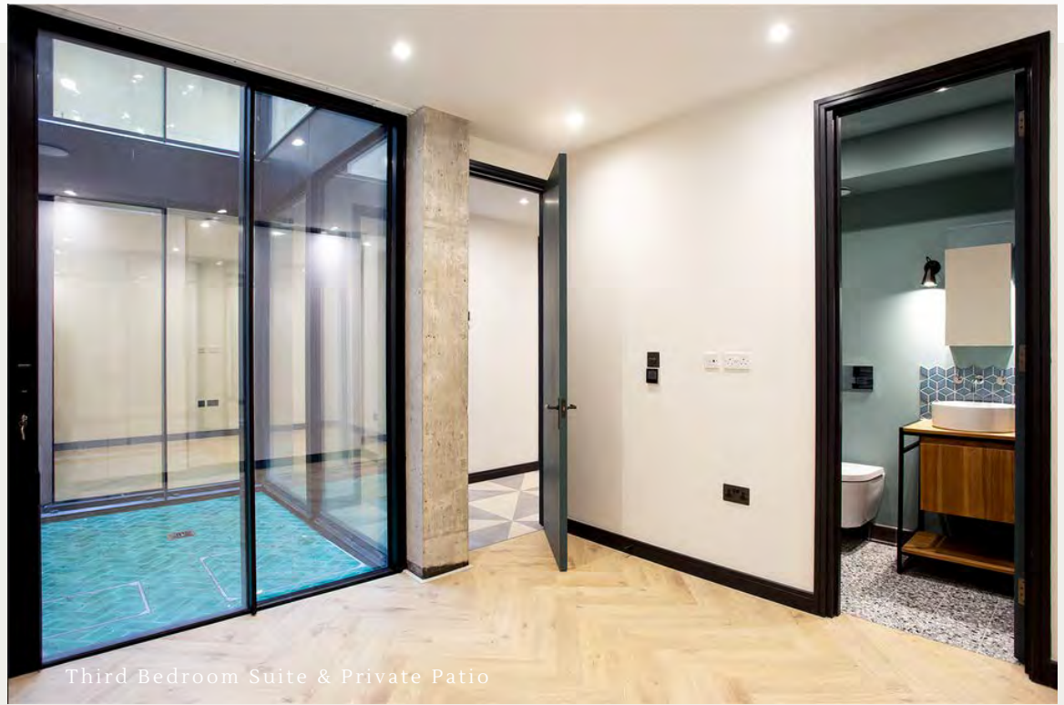
Third Bedroom Suite & Private Patio