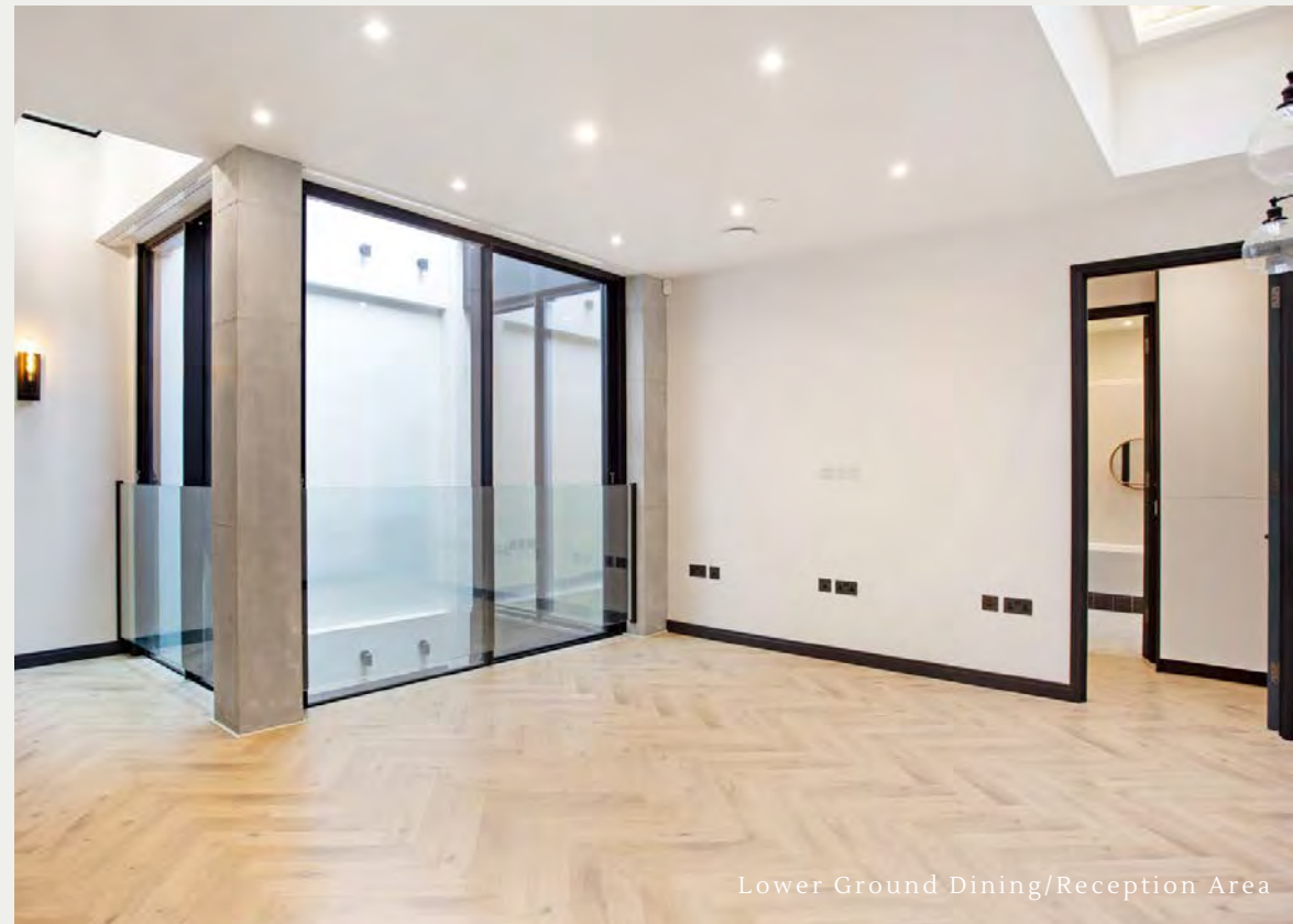
Lower Ground Dining/Reception Area