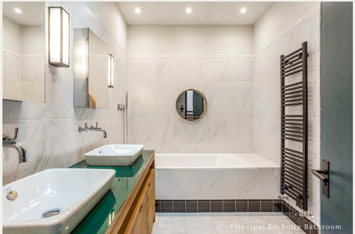
Principal En-Suite Bathroom