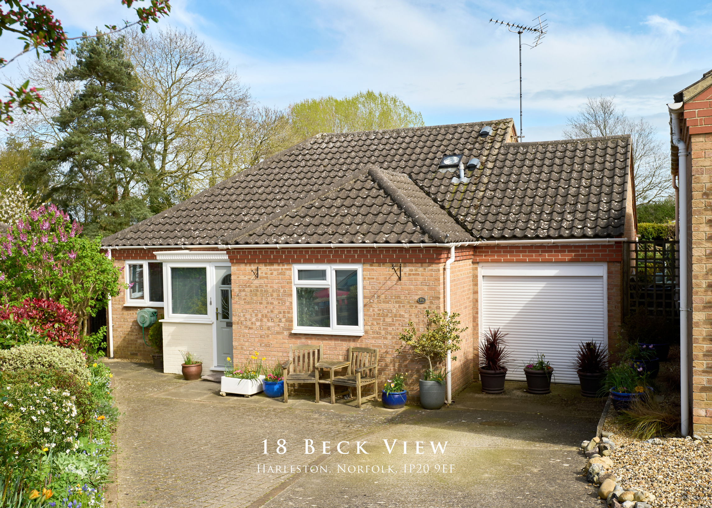
18 BECK VIEW HARLESTON, NORFOLK IP20 9EF