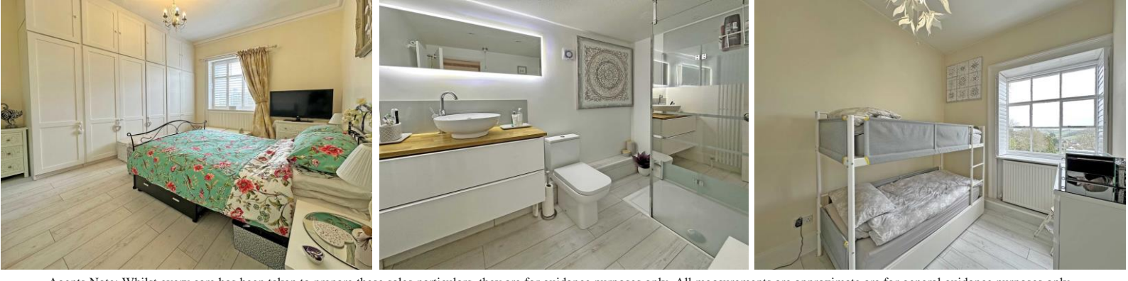
Agents Note: Whilst every care has been taken to prepare these sales particulars, they are for guidance purposes only. All measurements are approximate are for general guidance purposes only and whilst every care has been taken to ensure their accuracy, they should not be relied upon and potential buyers are advised to recheck the measurements. West of Exe is a trading name for East of Exe Ltd, Reg. no. 07121967