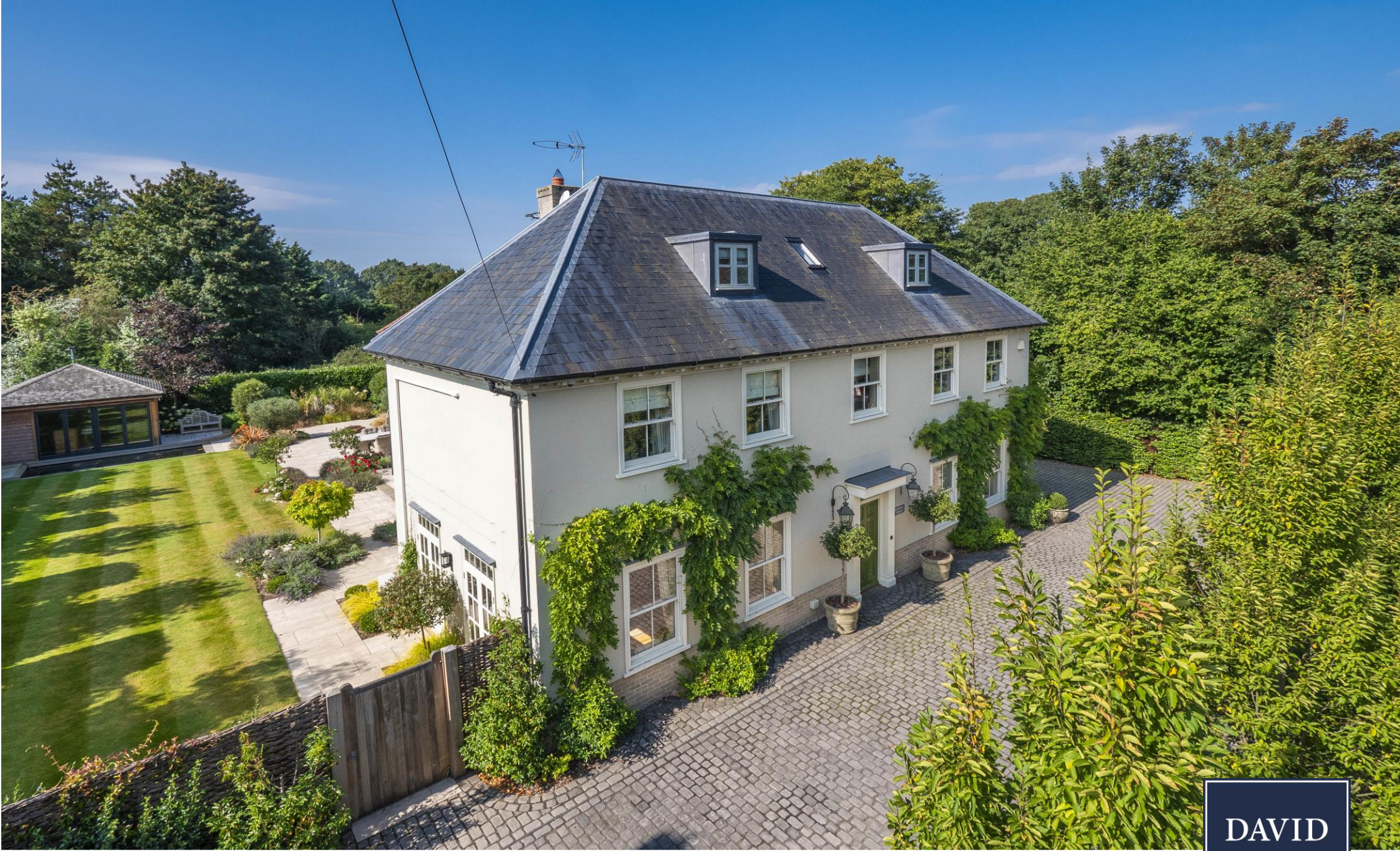
Burwell House, Fornham St Martin, Bury St Edmunds, Suffolk.