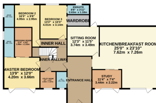
TOTAL FLOOR AREA : 3200 sq.ft. (297.3 sq.m.) approx.

Whilst every attempt has been made to ensure the accuracy of the floorplan contained here, measurements of doors, windows, rooms and any other items are approximate and no responsibility is taken for any error, omission or mis-statement. This plan is for illustrative purposes only and should be used as such by any prospective purchaser. The services, systems and appliances shown have not been tested and no guarantee as to their operability or efficiency can be given.