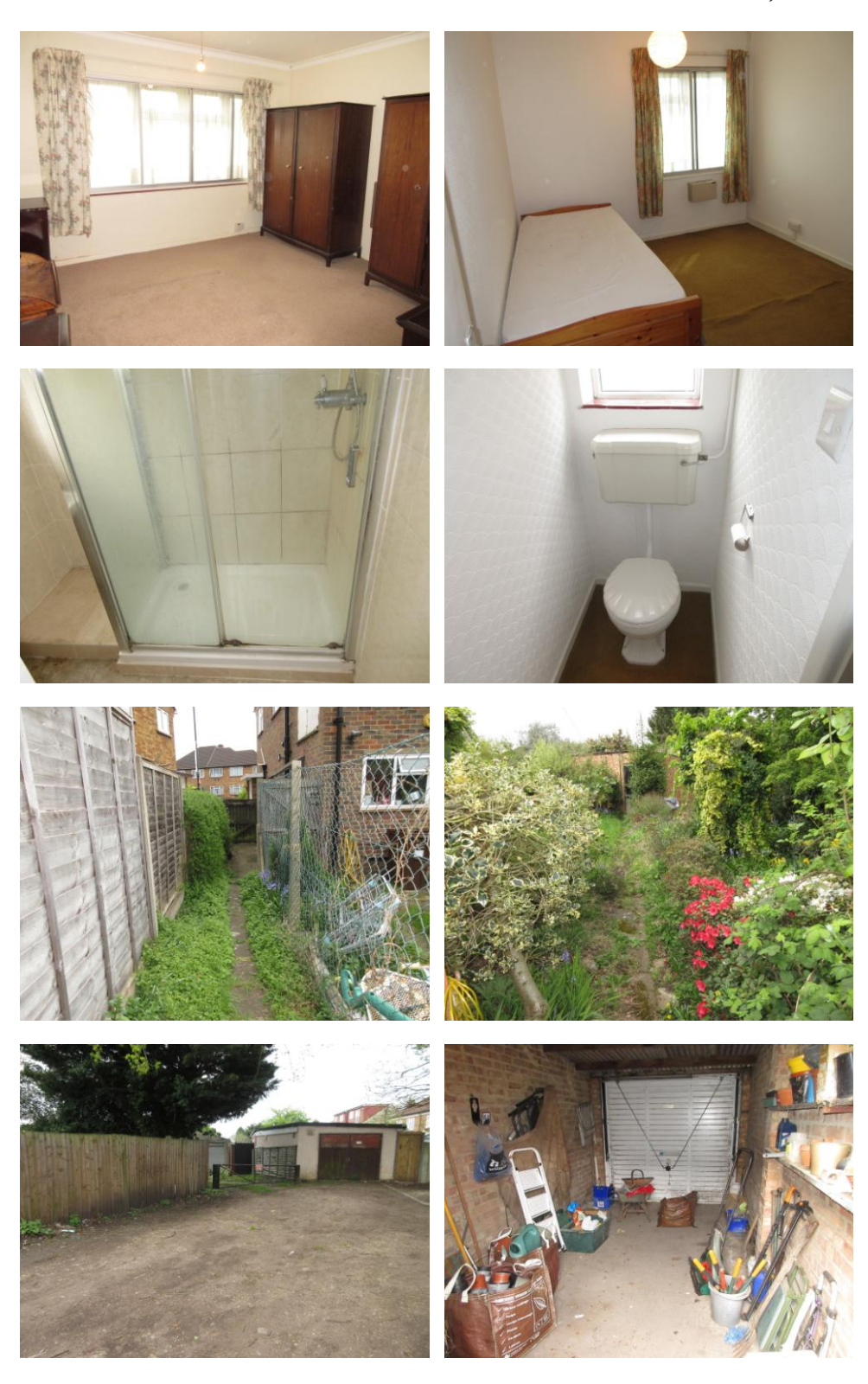
Please note that it is not our policy to test services or domestic appliances, so we cannot verify that they are all in working order. The purchaser might check for themselves or obtain verification from their solicitor or their surveyor.