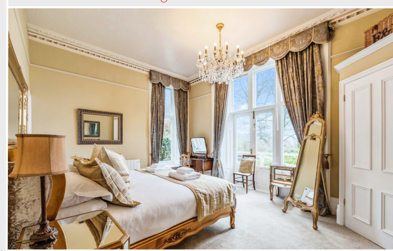
Kingsize Bedroom 1