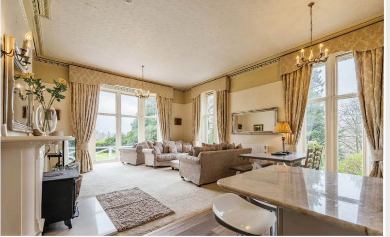
Open Plan Lounge