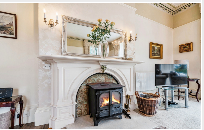
Ornate Fireplace and Stove