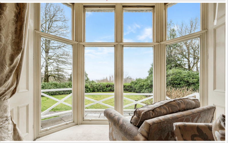
Bay Window in Lounge