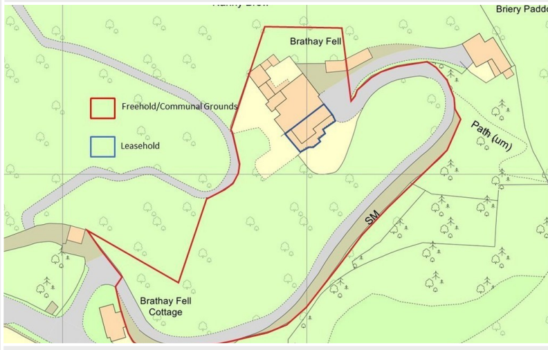
OS Map Ref 00998251