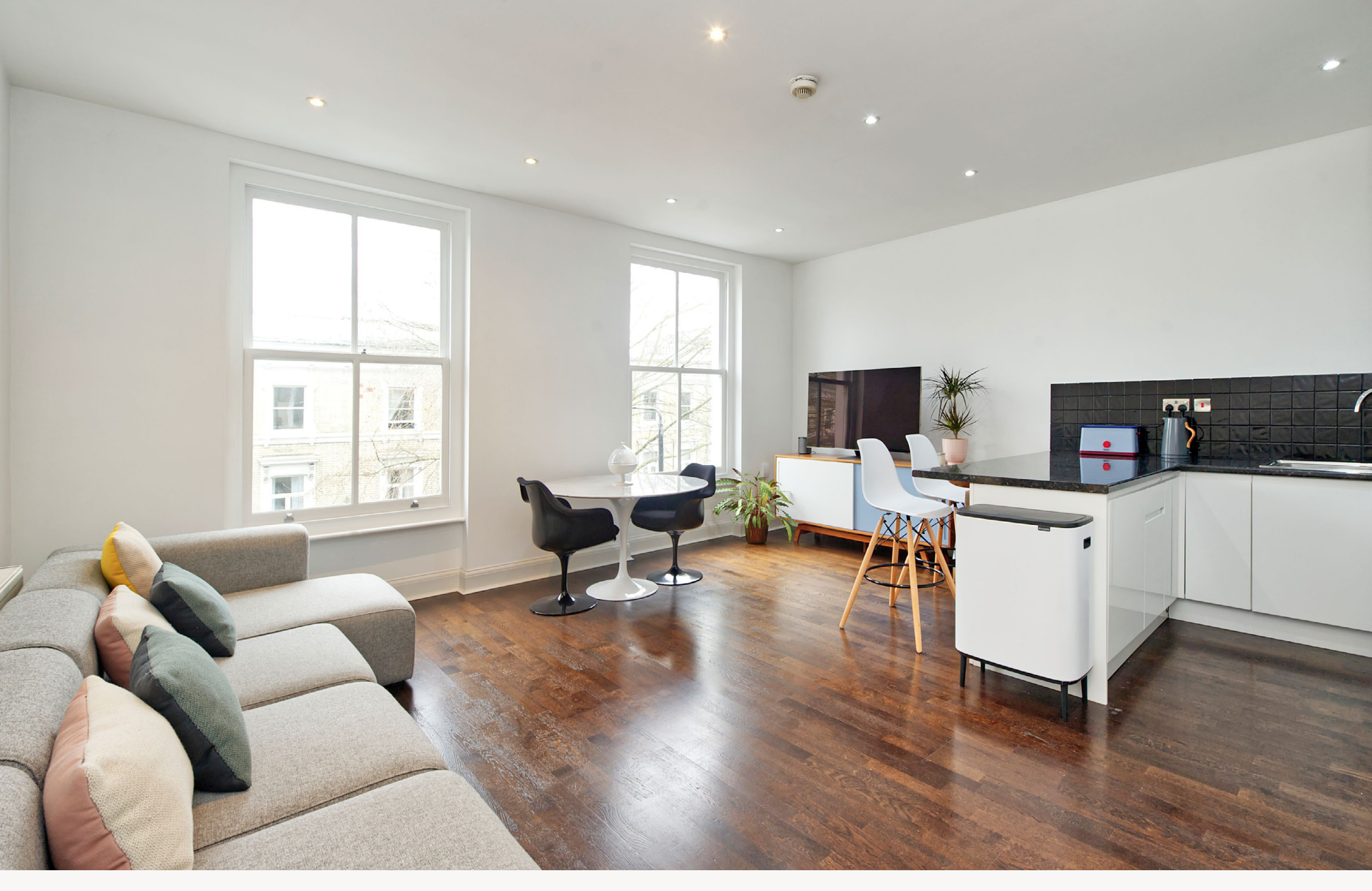
41 Finborough Road Chelsea SW10