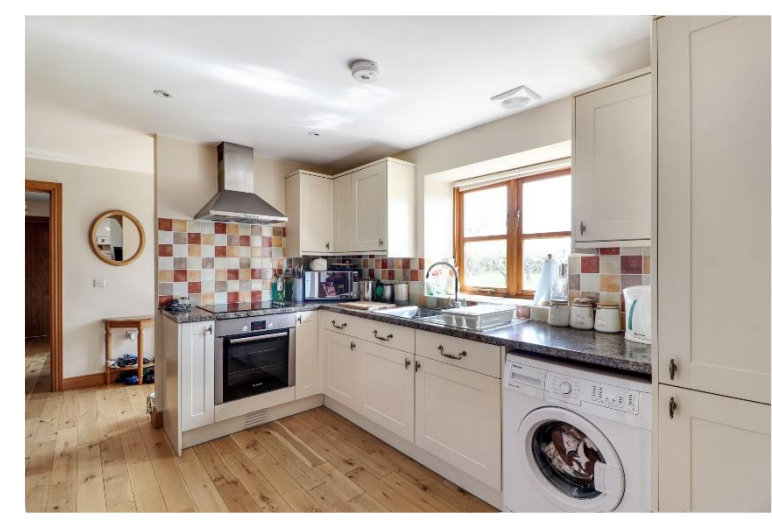
LOT 2 - PLOVERS REST – 0.21 ACRES

Plovers Rest is a converted barn with a Holiday Let consent. Accommodation comprises the following: -