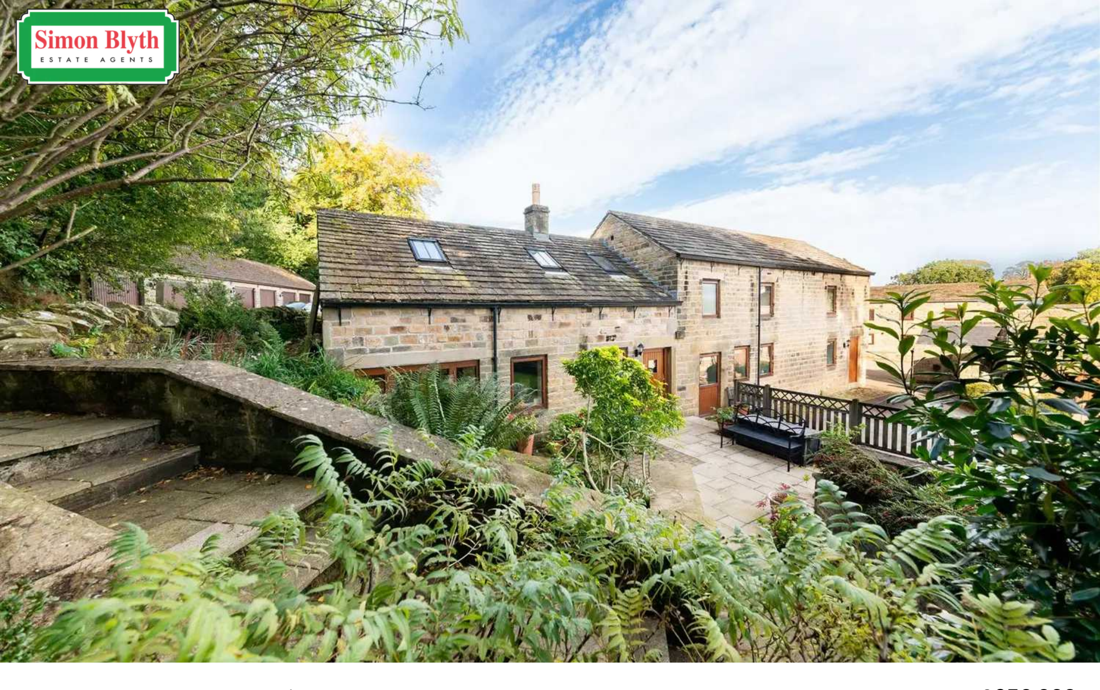
The Granary Huthwaite Lane, Thurgoland Sheffield