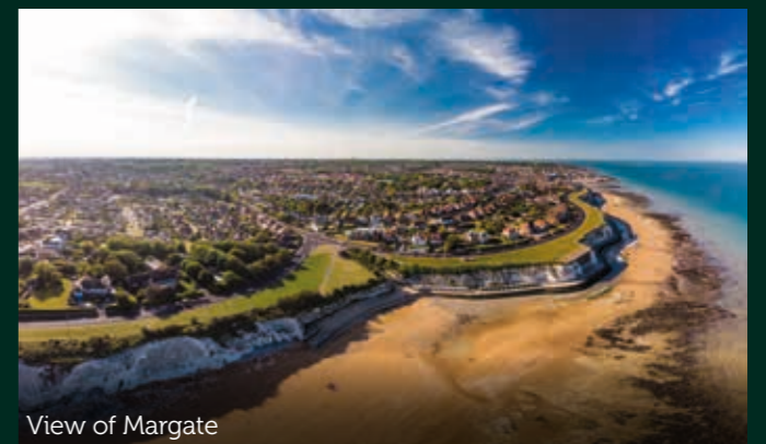
View of Margate

Alternatively, if you need to get away from it all, there is a wealth of beautiful local countryside and coastline to explore. The 32-mile Viking Coastal Trail provides the perfect outing if you are feeling energetic. Alternatively take a leisurely drive around the countless picturesque surrounding villages to absorb the area's vast local history and charm.