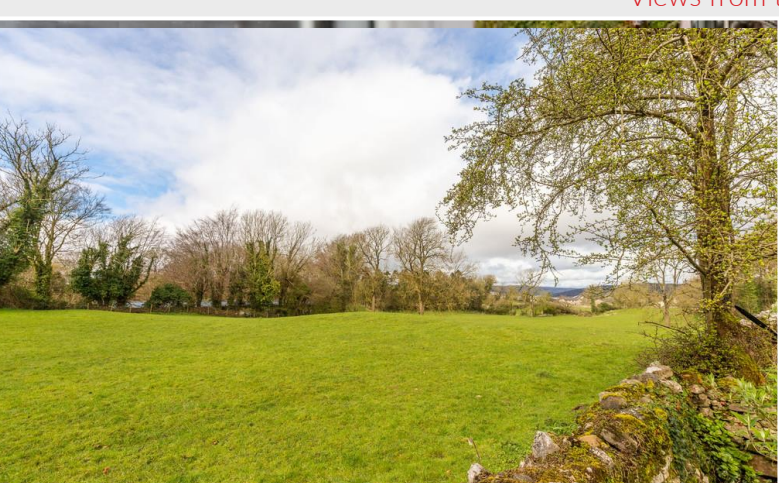
Field View from Rear Garden