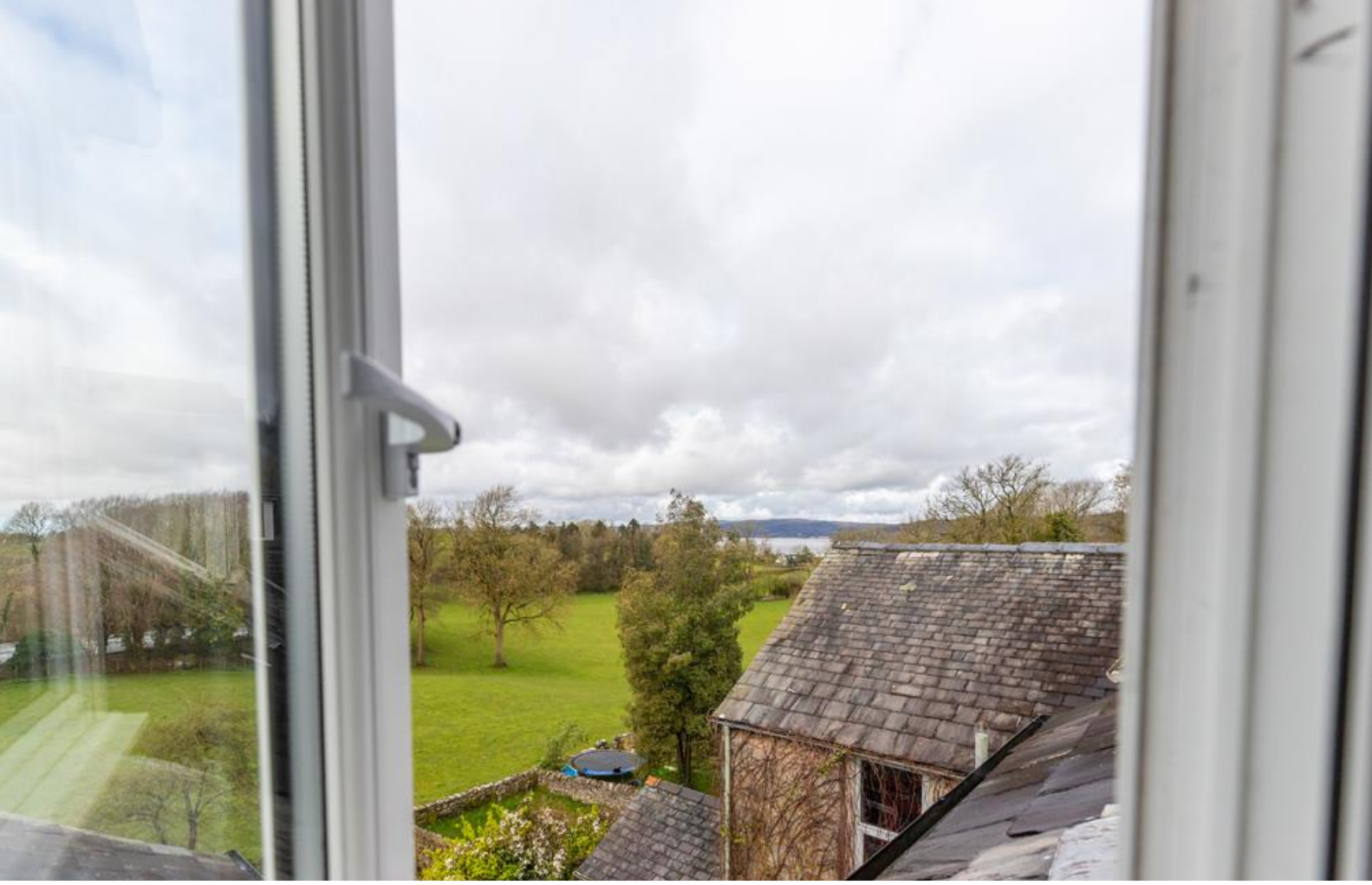
Views from the Loft Room