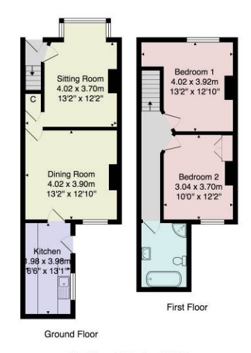
Total Area: 78.0 m² ... 840 ft² All measurements are approximate and for display purposes only. No liability is accepted by either the agency or Tox Property Solutions Ltd as to the exact measurements of the rooms. Box Property Solutions Ltd retains the copyright on this plant and allows agents to use it with agreed permission.