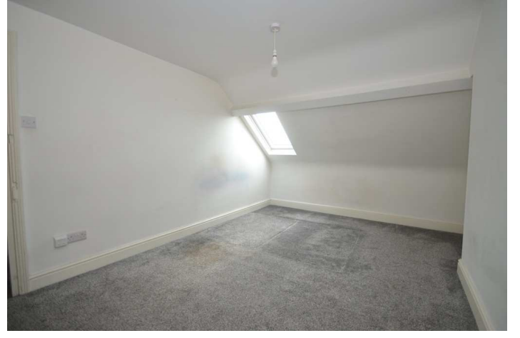
9' 4" x 15' 4" (2.84m x 4.67m) Electric radiator