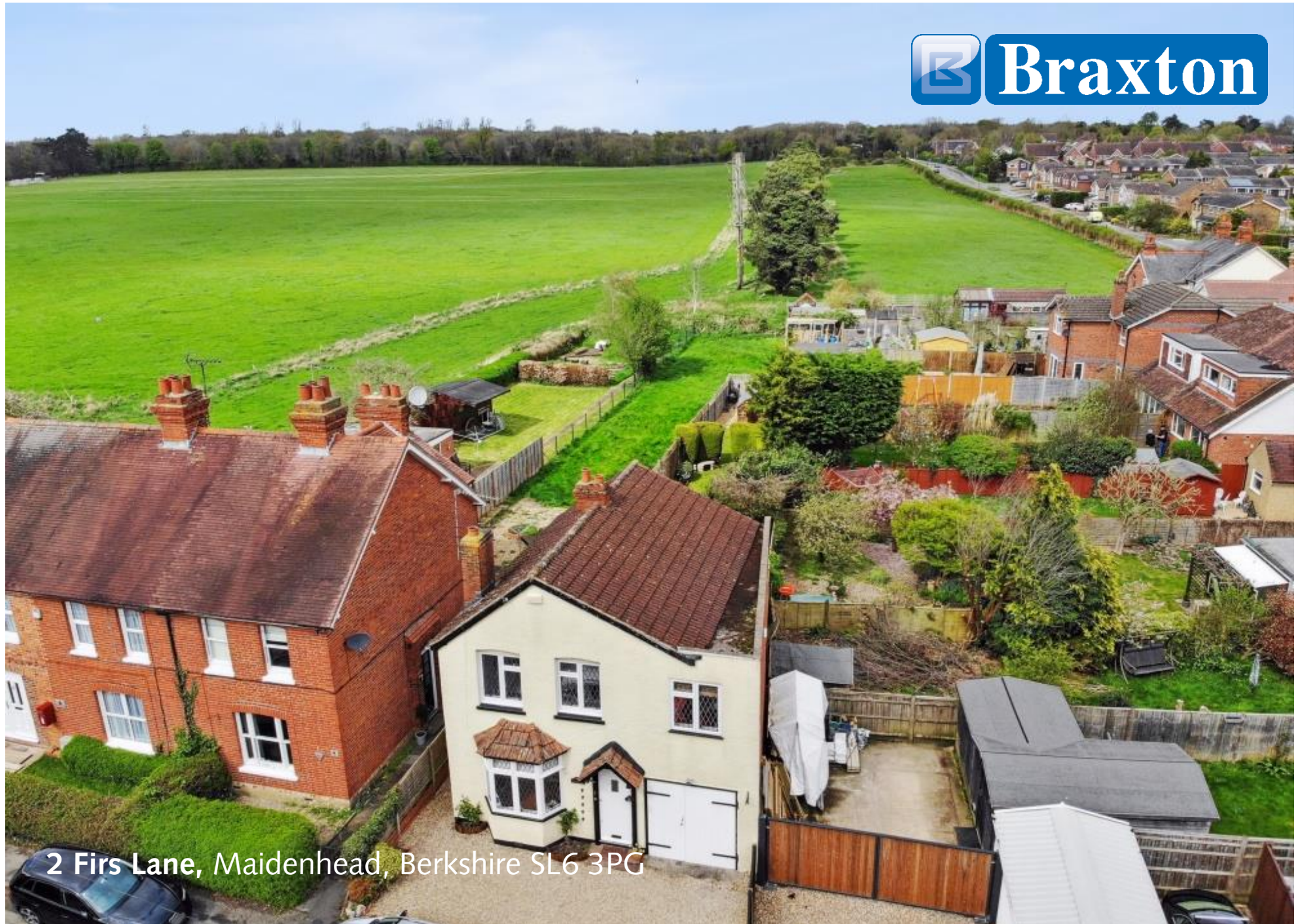
2 Firs Lane, Maidenhead, Berkshire SL6 3PG