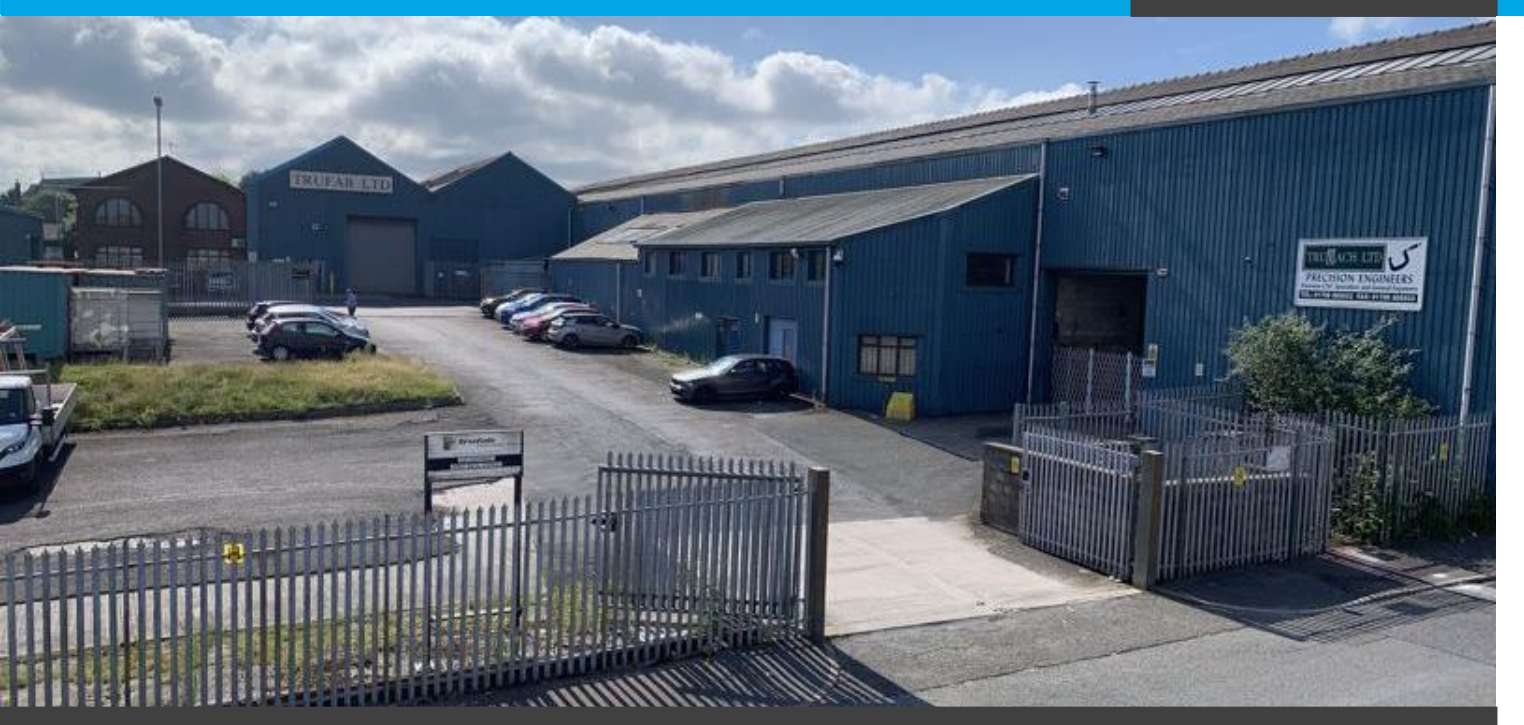
Railway Works, Fishwick Street, Rochdale, OL16 5NA