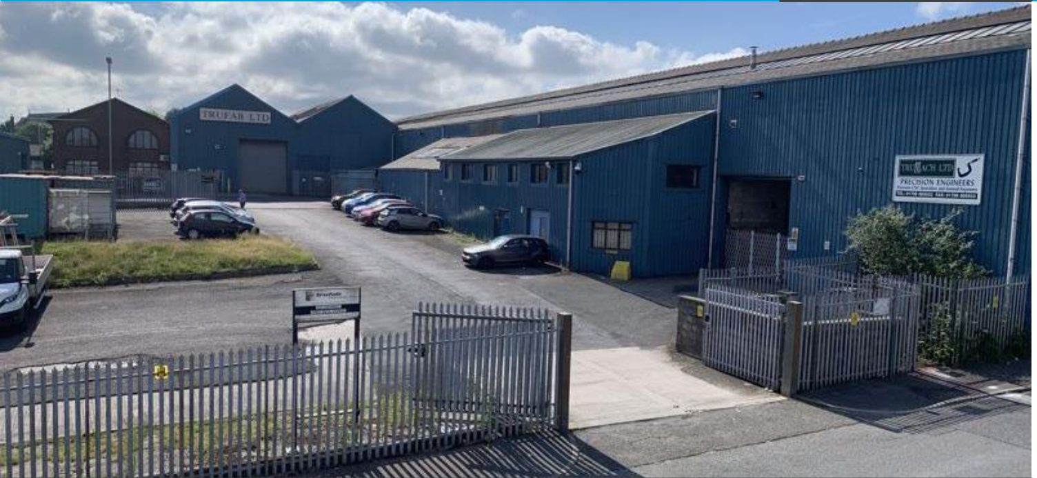
Railway Works, Fishwick Street, Rochdale, OL16 5NA