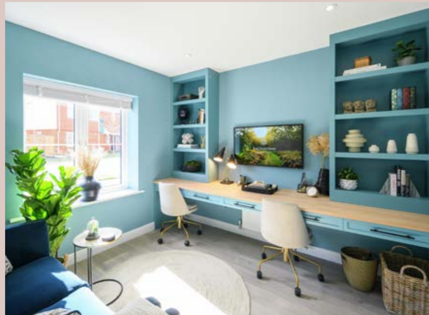
Interior photography is of the Foal Hurst Green show home and is indicative only.

Berkeley Foal Hurst Green Sales and Marketing Suite Badsell Road Paddock Wood TN12 6LP Open daily 10am – 5pm