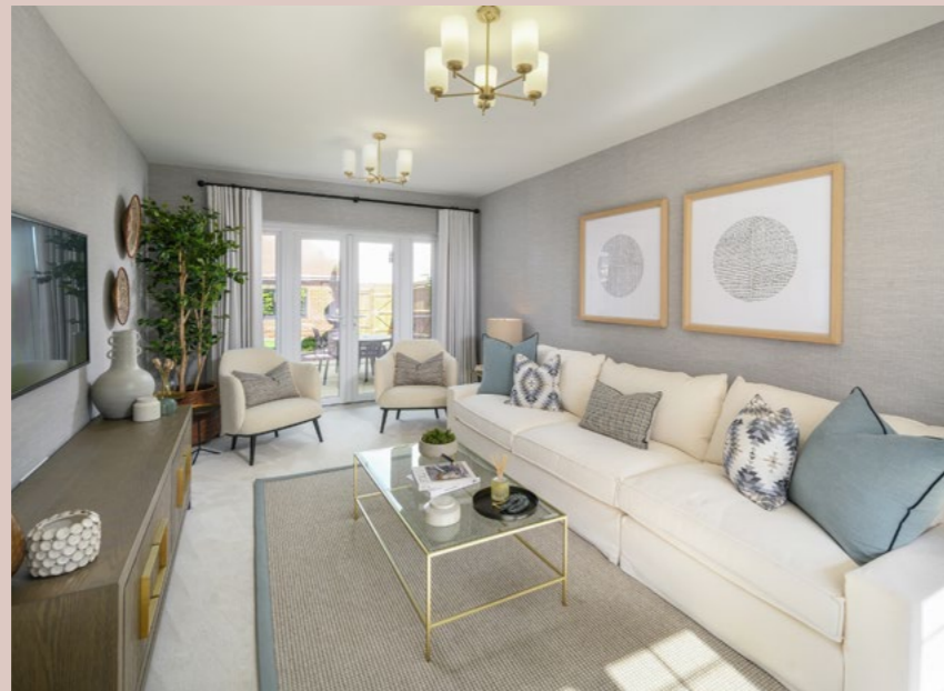
Interior photography is of the Foal Hurst Green show home and is indicative only.

Berkeley Foal Hurst Green Sales and Marketing Suite Badsell Road Paddock Wood TN12 6LP Open daily 10am – 5pm