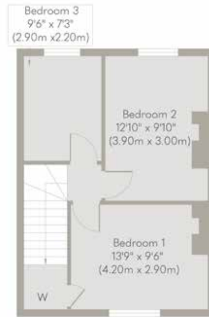
First Floor Approximate Floor Area 384 sq. ft (35.70 sq. m)