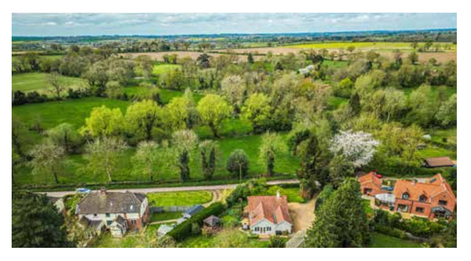
Bluebells has uninterrupted views across the neighbouring meadow.

"...nestled within a glorious plot of around half an acre (STMS), Bluebells is the perfect countryside home."