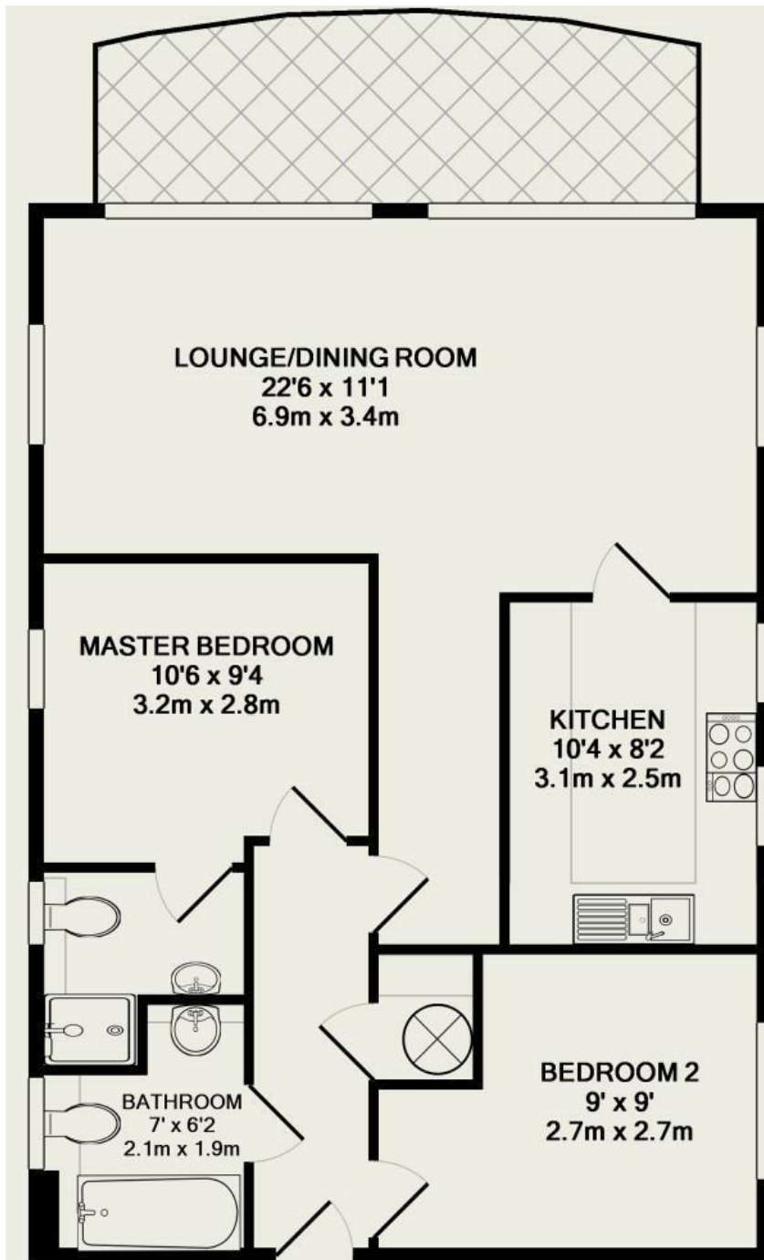
This floorplan is for illustration purposes only. The measurements and position of each element are approximate and must be viewed as such.