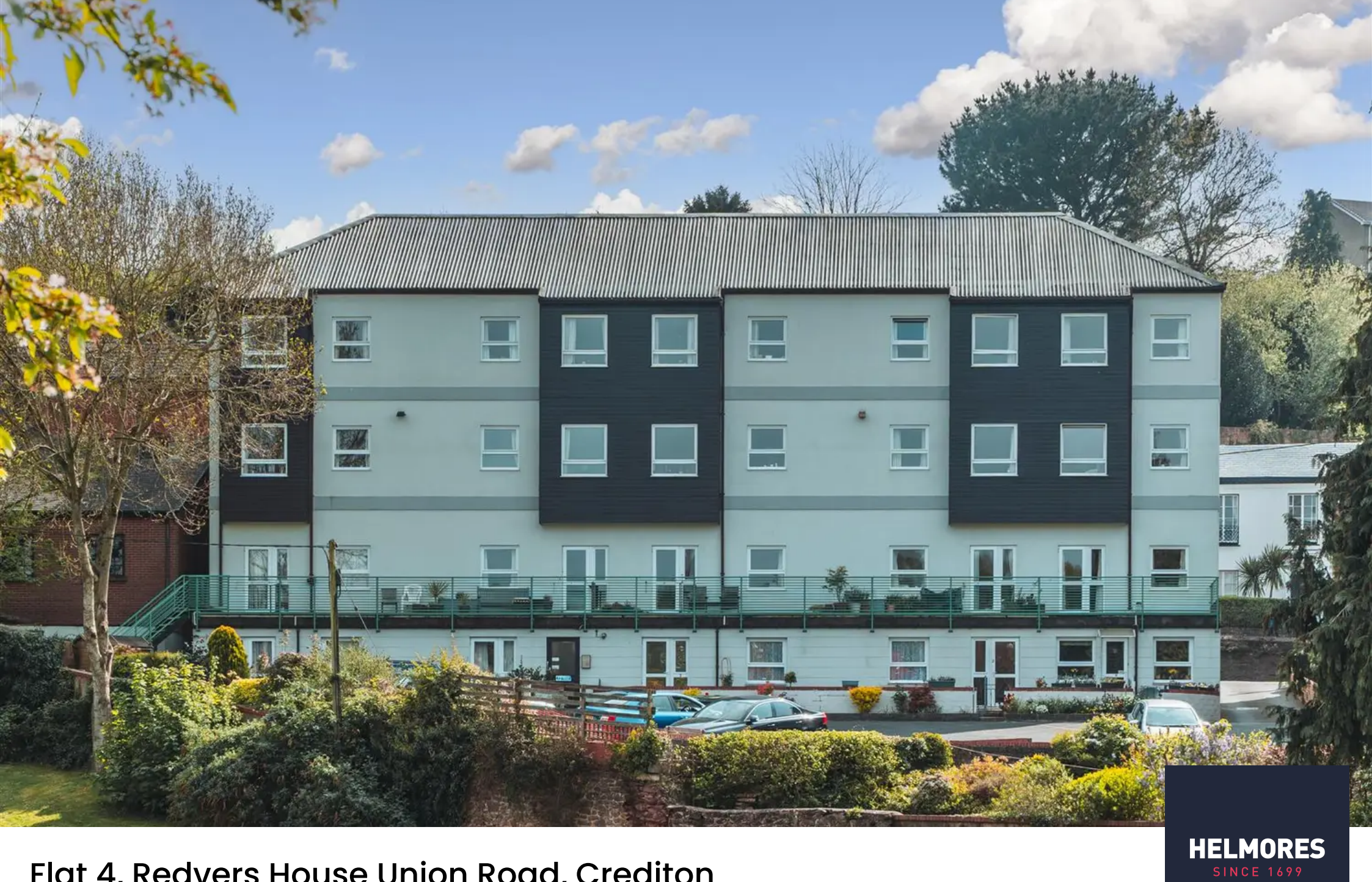
Flat 4, Redvers House Union Road, Crediton Guide Price £83,000