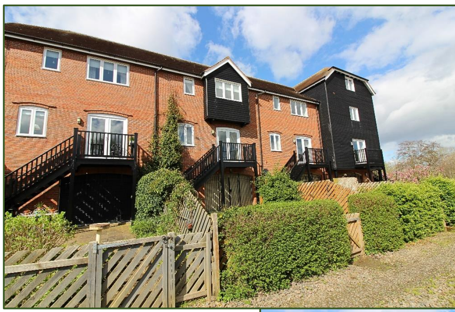
<u>Rear Garden</u> this terraced garden with paving stones and low maintenance gravelled areas lead down to a pedestrian gate and access to the mooring

<u> Garage </u> measuring approximately 19'7'' \ge 21'6'' (5.97m \ge 6.55m) with single electric up and over door, there is mains water tap, light and power, manual metal roller door. Heavy duty metal gated access into garden.