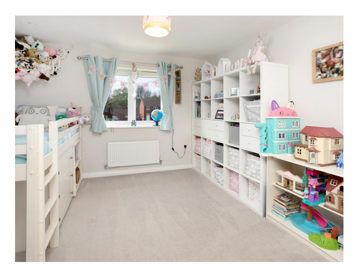
GENERAL REMARKS AND STIPULATIONS:

Tenure: The property is offered for sale freehold by private treaty with vacant possession on completion.