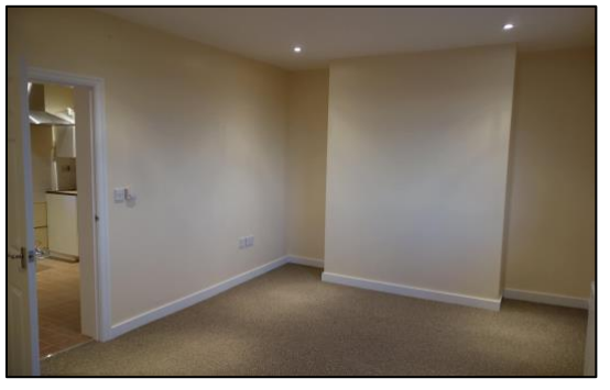
TO LET - 2 Bank Farm Cottages, Forty Foot Bank, Ramsey Forty Foot, Huntingdon, PE26 2XR