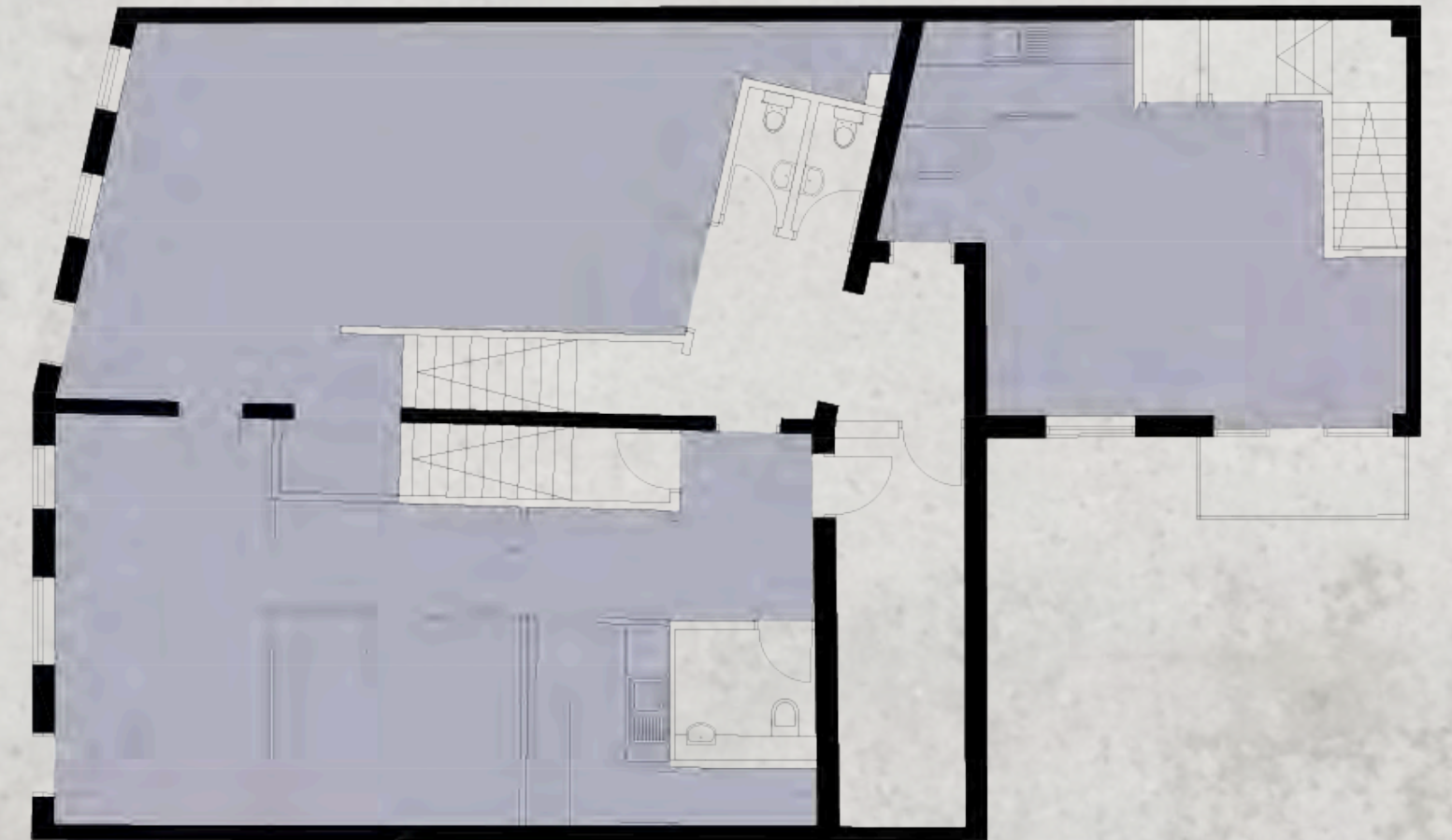
First Floor 1,304 SQ.FT