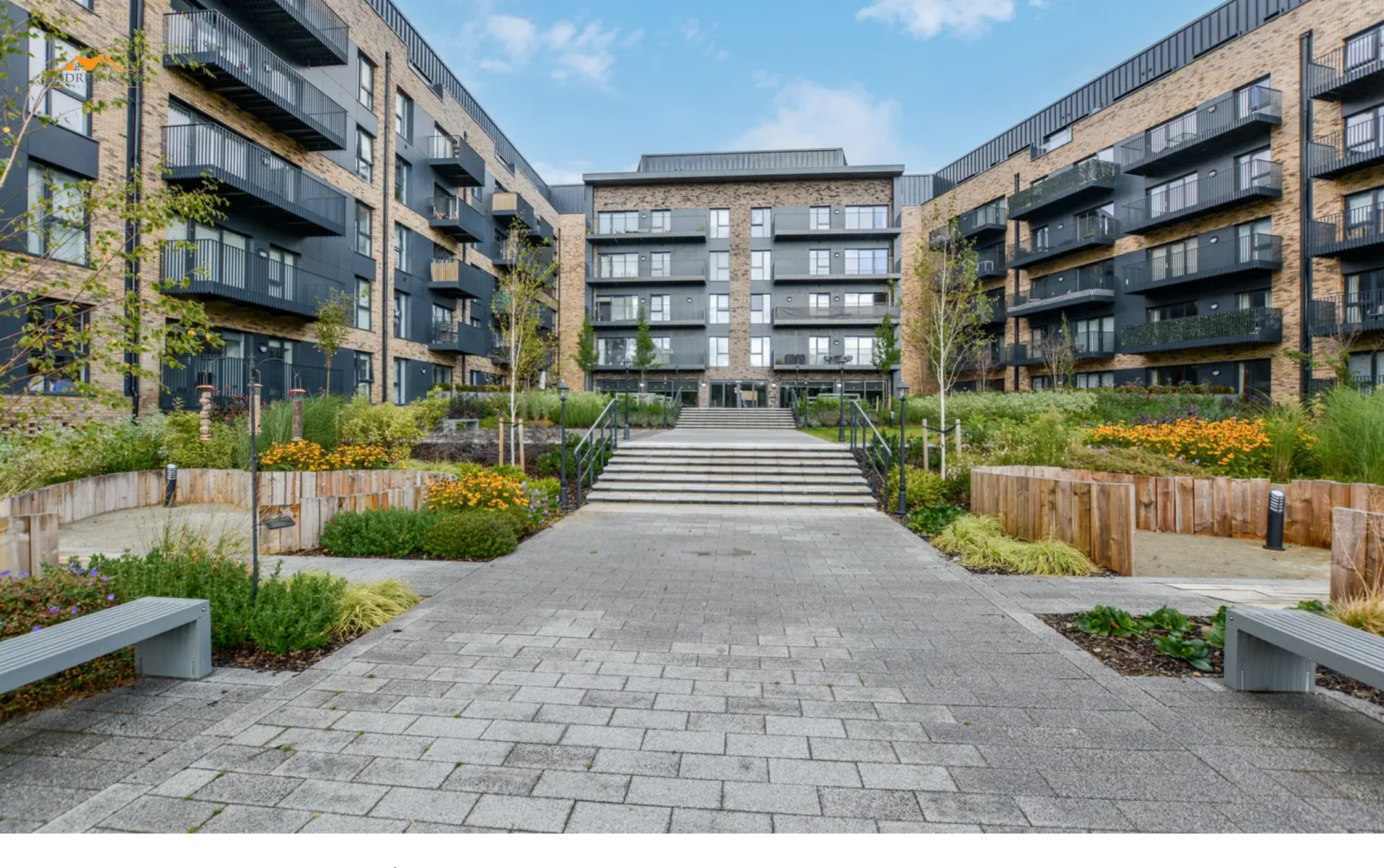
124 George Street, Ashford In Excess of £210,000