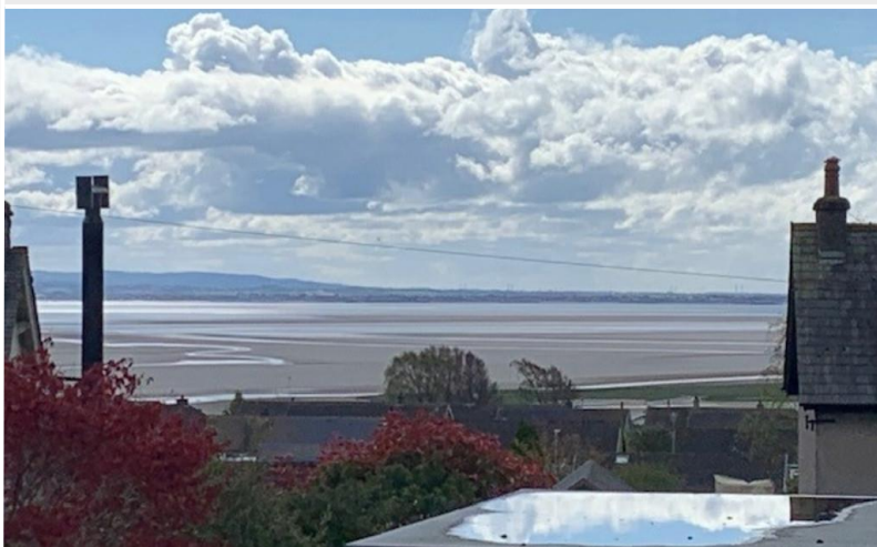
View from Lounge and Garden