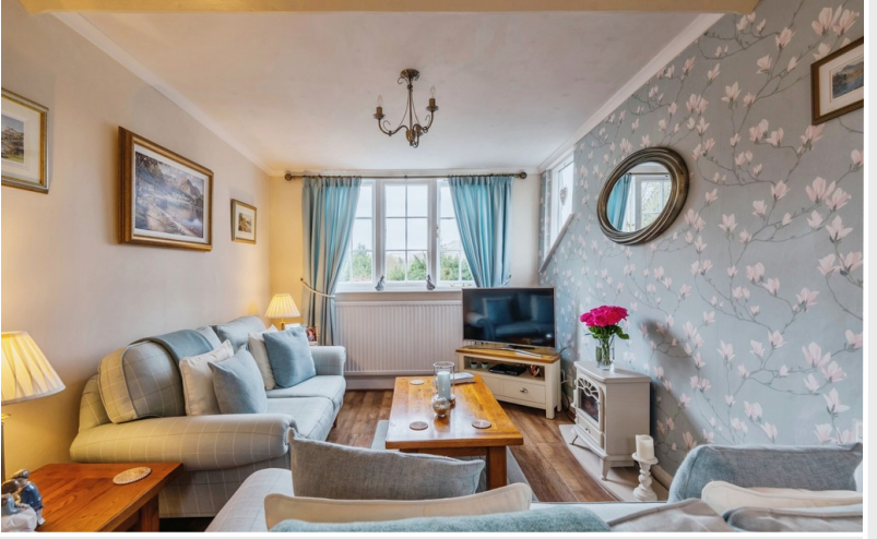
Open Plan Kitchen/Living Room