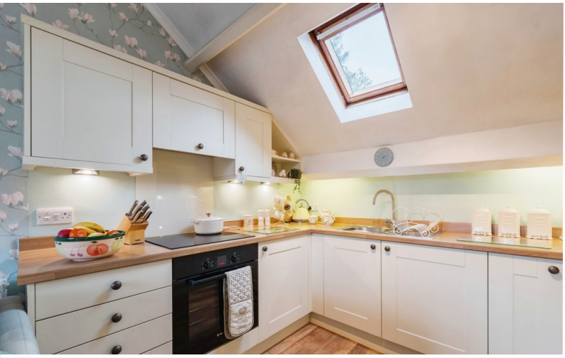
Open Plan Kitchen/Living Room