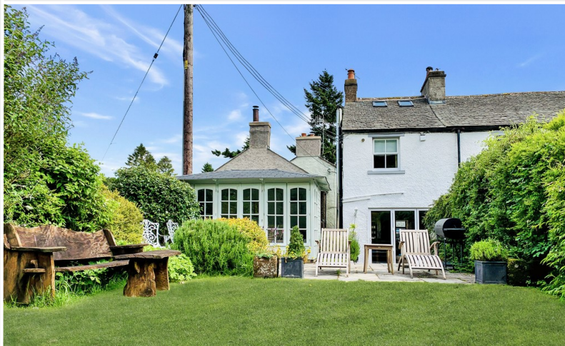
Rear Elevation and Garden