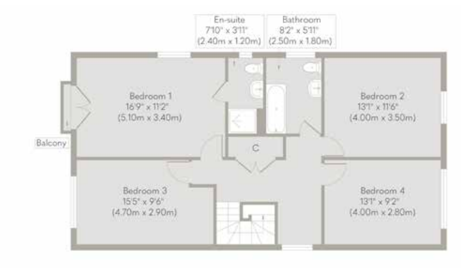
First Floor Approximate Floor Area 861 sq. ft (80.00 sq. m)