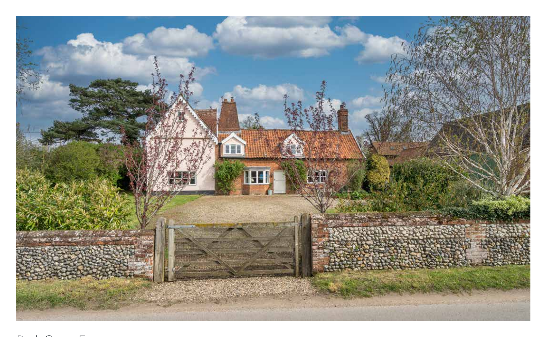
Rush Green Farm Rush Green | Barnham Broom | Norfolk | NR9 4EA