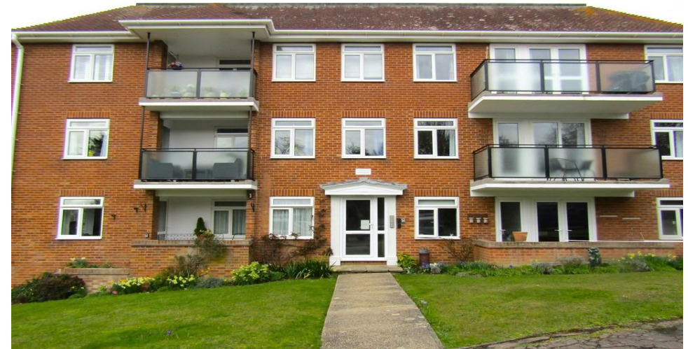
Holland Road Frinton-on-Sea

Rent: £1,200 pcm Energy Efficiency Rating TBC