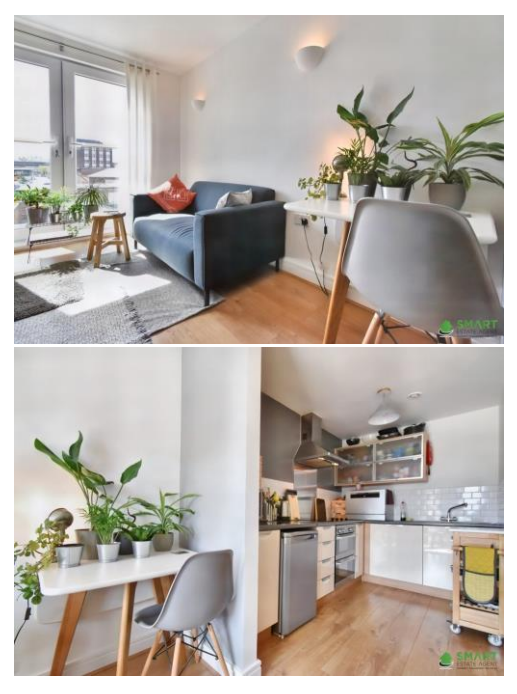
Acland House Verney Street, Exeter, EX1 2FE