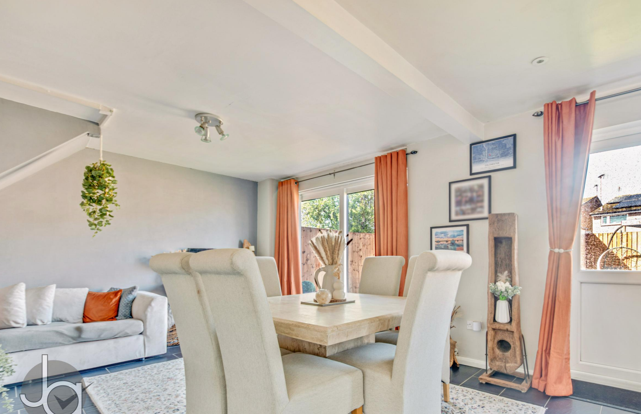
Onslow Crescent, Colchester, CO2 8UW