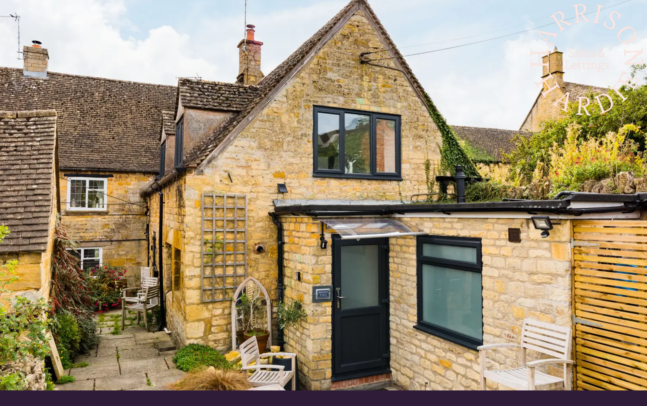
Angels' Folly, Bourton On The Hill