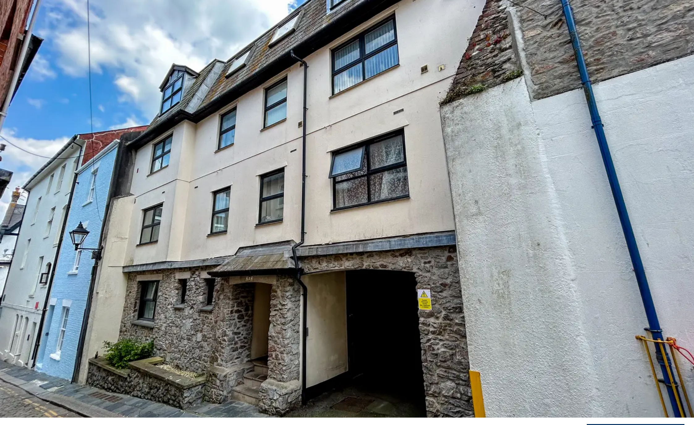
2-3 Stokes Lane, Plymouth, PL1 2LW £120,000 LEASEHOLD EPC:TBC