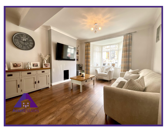
Grosvenor Road, Abertillery, NP13 1PA