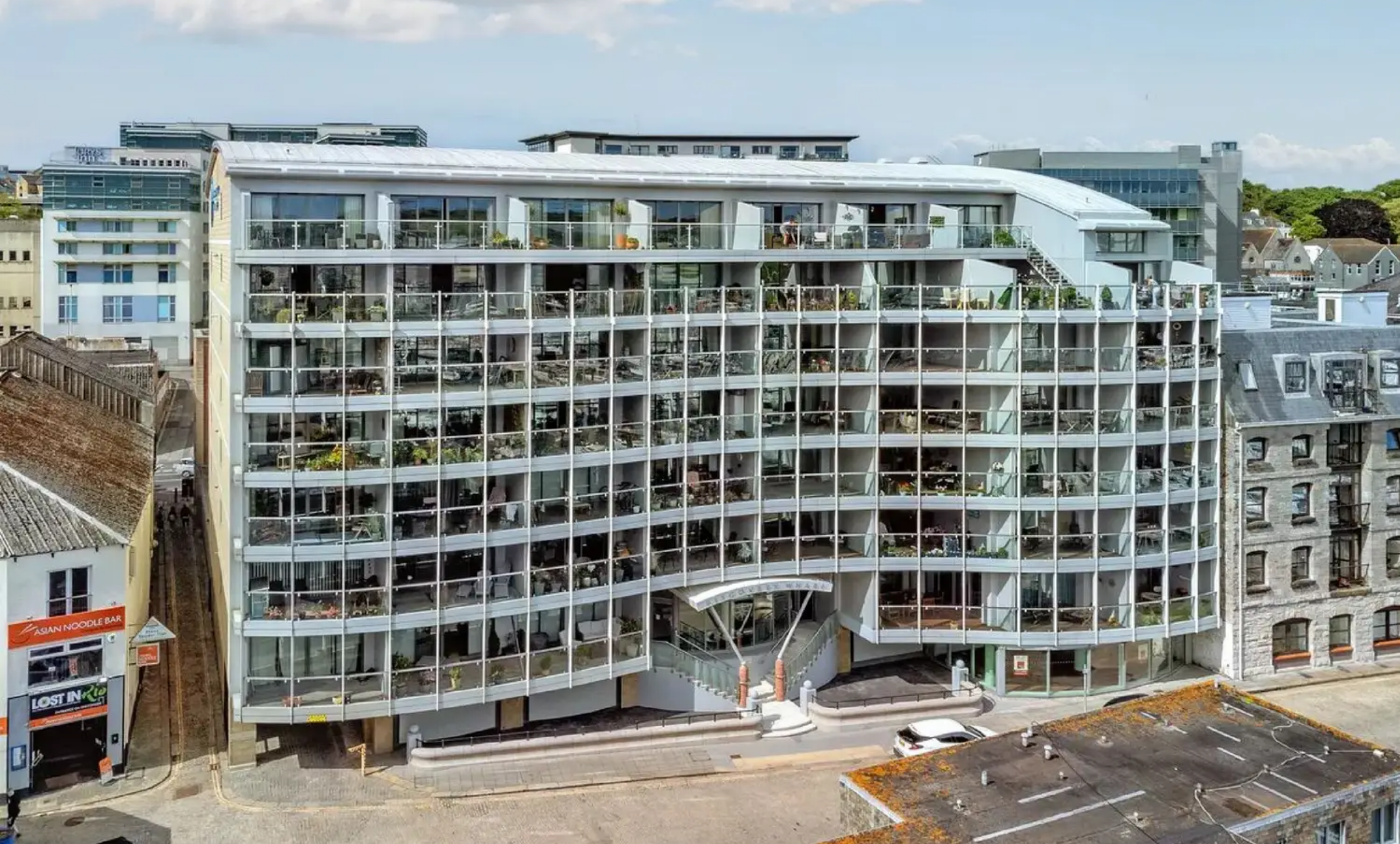
Flat 27, Discovery Wharf, 15 North Quay £350,000