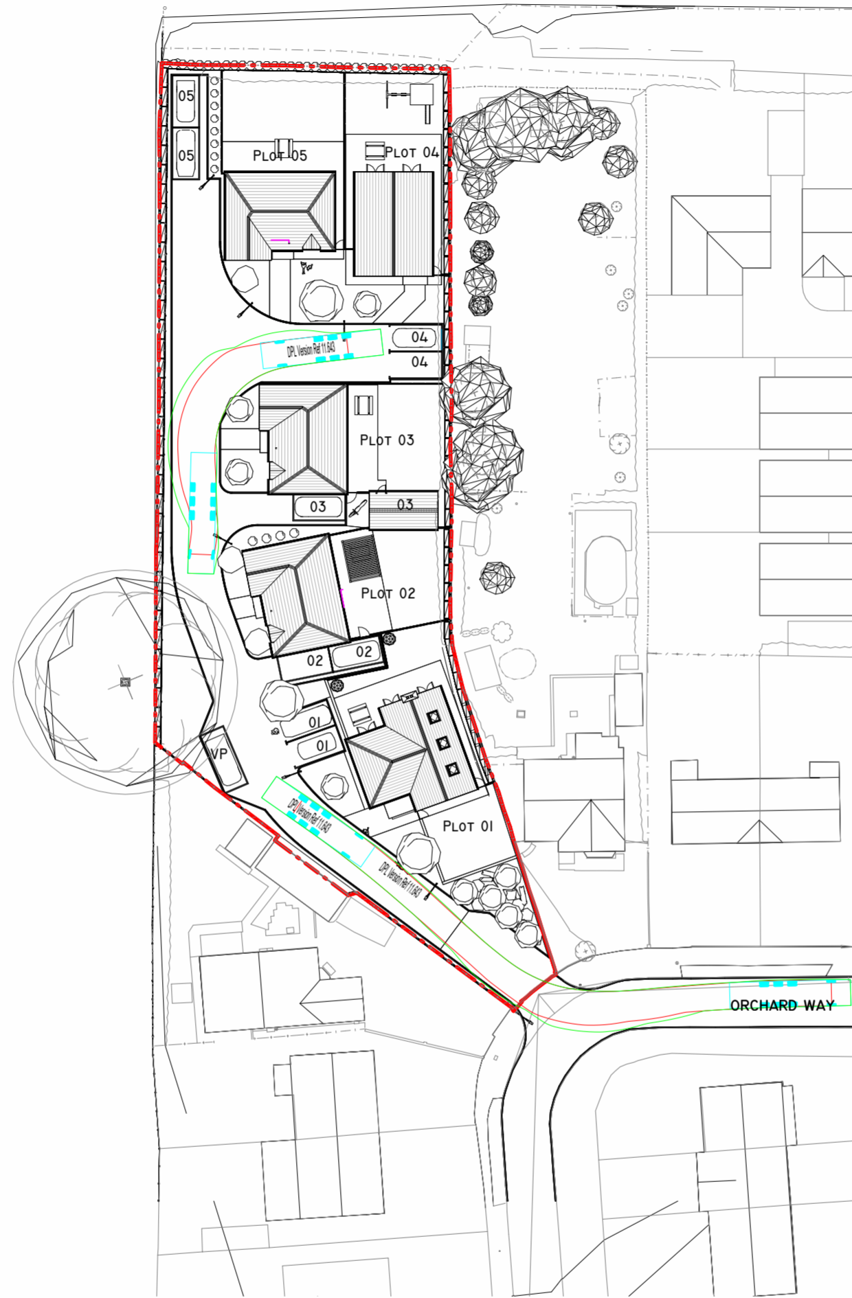
2 VEHICLE EGRESS PLAN 1 : 500