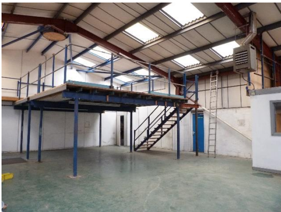
As at March 2019

Vehicle repair/maintenance uses will not be considered.