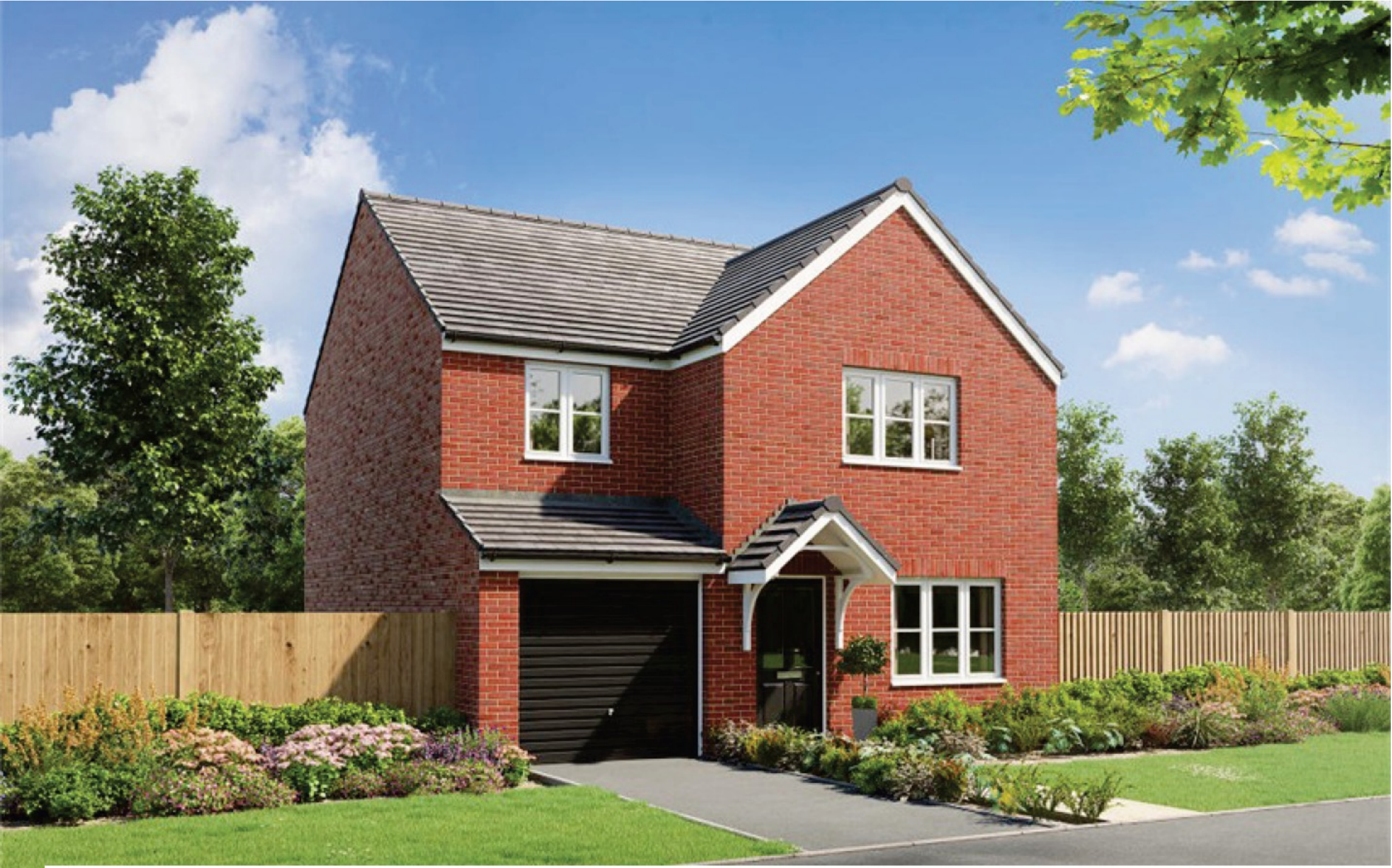
The Gisburn, Witney