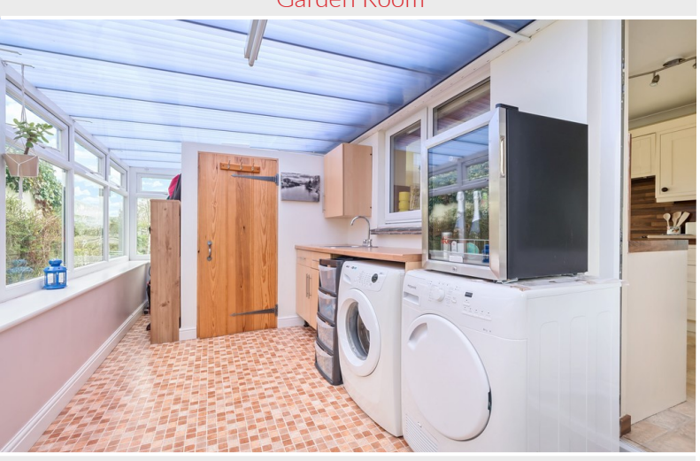
Conservatory / Utility Room

An outstanding immaculately presented modern detached three bedroom bungalow enjoying a tranquil semi-rural setting with fell views in Sockbridge village located at the periphery of the Lake District National Park approximately 3.5 miles from Penrith and 2.5 miles from Ullswater at Pooley Bridge.