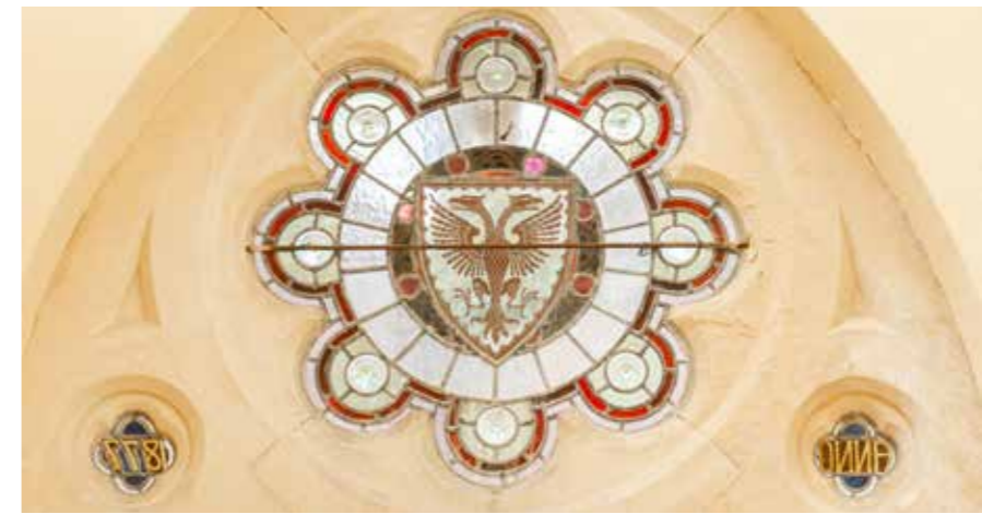
Hoare family crest

"The building holds an incredibly fascinating past."