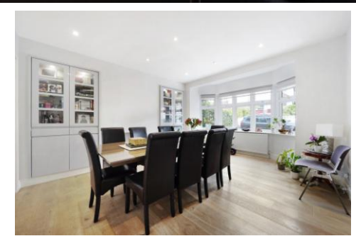
Broughton Avenue, London £1,350,000 Freehold

Mile are pleased to offer this rare and stunning four bedroom house to the market. The property consists of a large triple through lounge space with dining area, dining area and children's play area, an open plan fully fitted kitchen, a guest wc, 4 double bedrooms and 2 bathrooms (one being En-suite). The property further benefits from a large split level garden, off street parking, Bespoke bi folding patio doors to open the entire area up seamlessly to the garden, Air-conditioning, electric Velux skylight windows and an Electric car charging station!. Located in a highly sought after area, only a stones throw to the park. IMMACULATE CONDITION!!!!!!