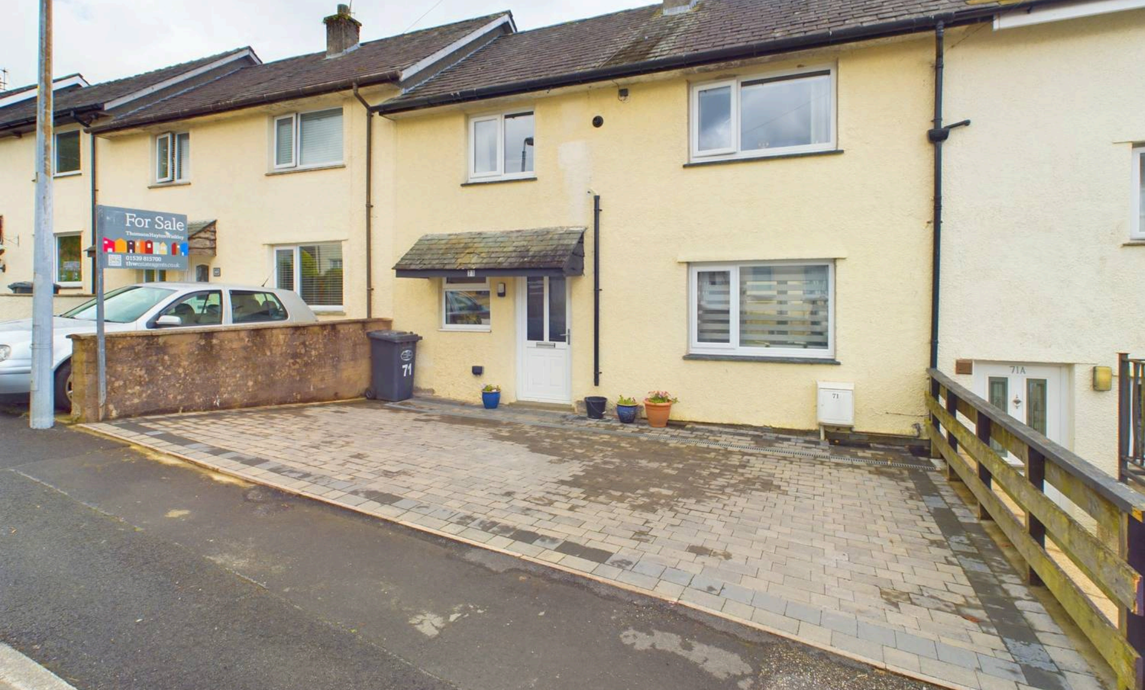
71 Claife Avenue, Windermere £300,000