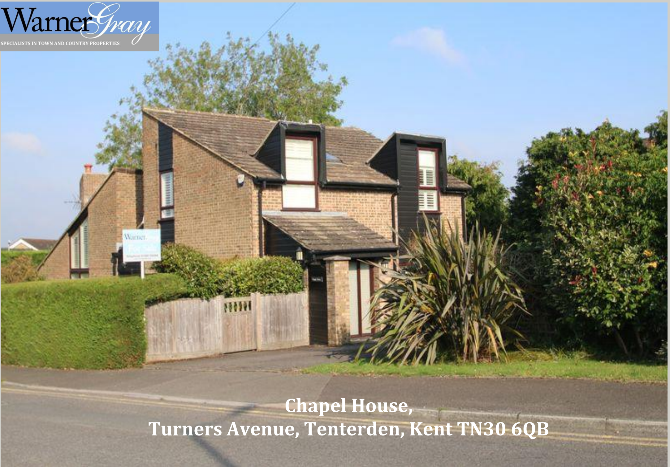
Chapel House, Turners Avenue, Tenterden, Kent TN30 6QB