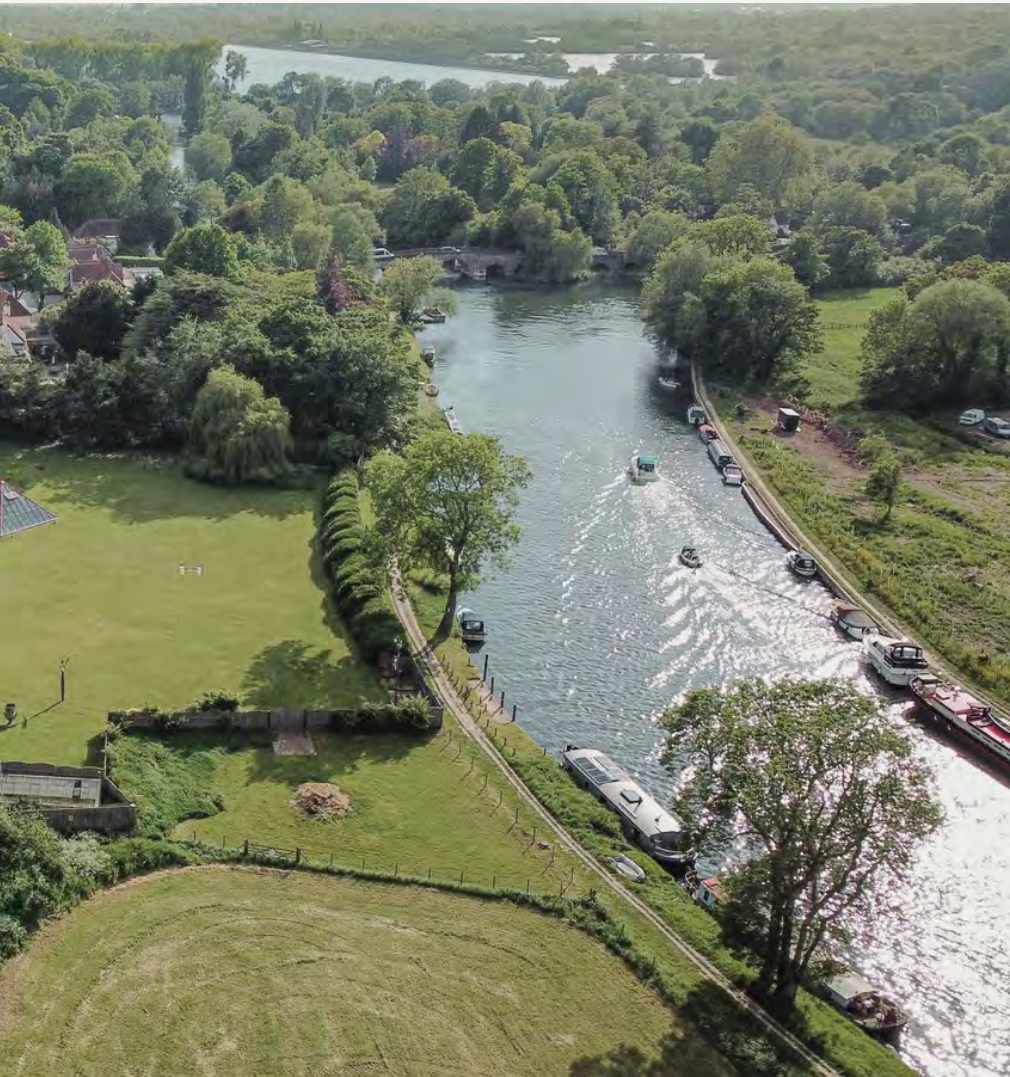
Thameside Manor's access to the River Thames

Situated on the Thames River, Sonning is a charming British countryside village in Berkshire, just a 45-minute commute from London and a quick 10-minute drive to Reading.