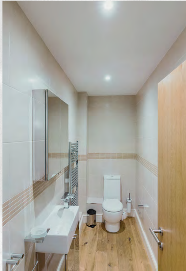
Existing Hallway Washroom

Each two-bedroom apartment offers residents a blend of spacious living and refined elegance, characterized by high ceilings and charming features like crown moulding.