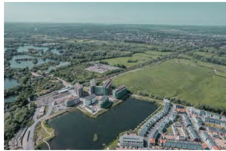
Green Park Business Park, Reading

Reading's population is expected to reach 169,730 (+4.36%) by 2035, nearly doubling the UK average growth rate. The town's robust IT and communications industries will fuel economic growth well above the national average in the next decade.