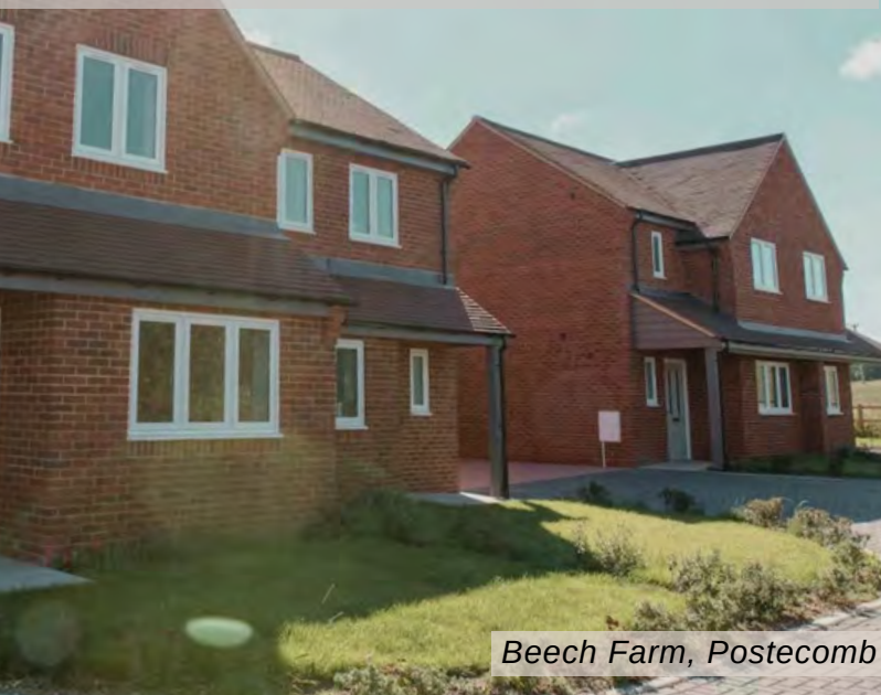
Beech Farm, Postcombe

In Postcombe, South Oxfordshire, Beech Farm comprises 8 tastefully finished semi-detached properties seamlessly blending with the landscape. Featuring 2 & 3 bed houses, the development caters to first-time buyers, growing families, and downsizers. High-spec interiors include quality fixtures, fittings, appliances, and decor.