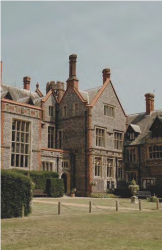
Reading Blue Coat School

international students from over 150 countries