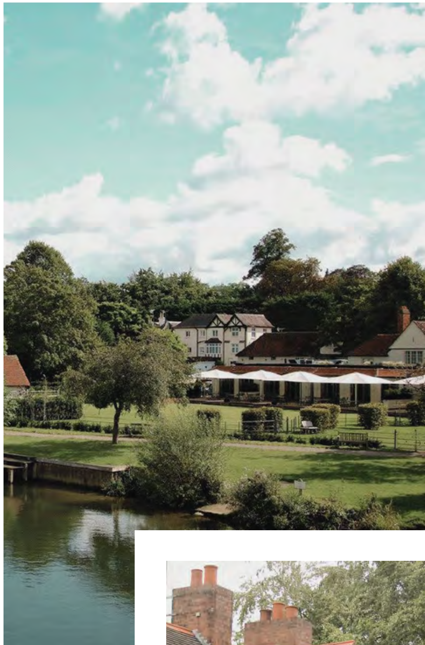
Thameside Manor Sonning