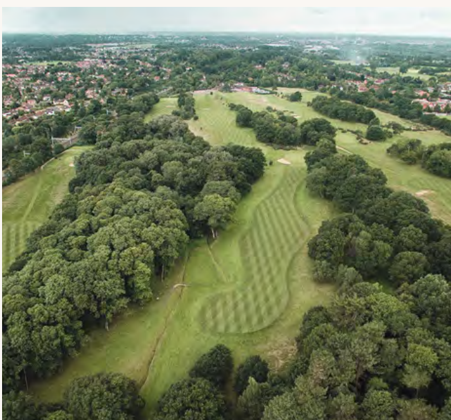
Sonning Golf Course

With iconic spots like the French Horn, the Bull, the Coppa Club, and The Mill Theatre, residents enjoy a mix of culture and leisure. The village boasts the expansive Dinton Pastures Country Park and Sonning Golf Club for outdoor pursuits.