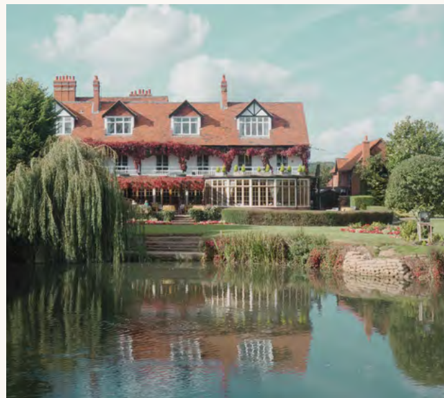
The French Horn

Surrounded by Henley-on-Thames, Reading, Pangbourne, and Twyford, Sonning offers a serene yet accessible lifestyle.