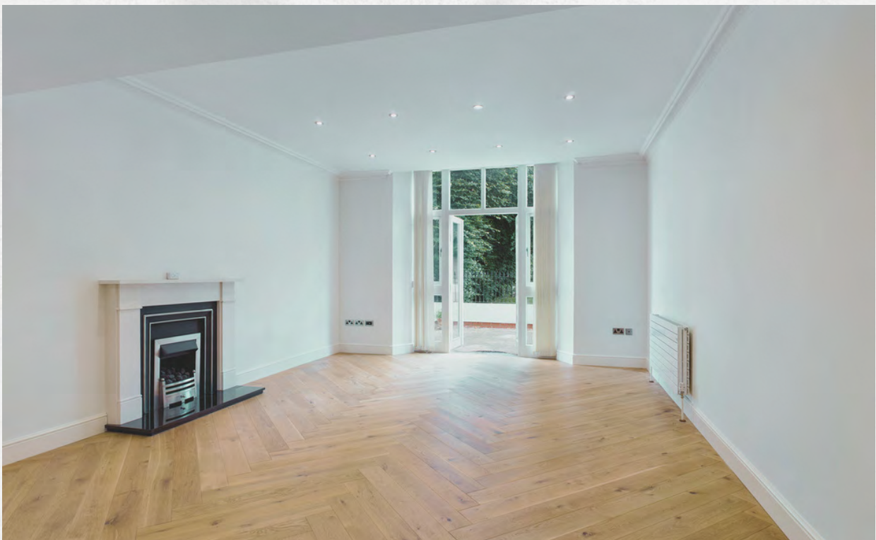
Elegant Living Rooms