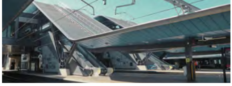
Reading Train Station

With access to world-class universities, good transport links, a consistently low unemployment rate (2.7% as of 2023), Reading has continuously attracted large international companies such as Microsoft, Hewlett Packard, Oracle and more recently Ericsson, Virgin Media, as well as the global pharmaceutical giant, Sanofi. With such a dynamic array of companies and work opportunities, Reading continues to attract a young and talented workforce to the area.