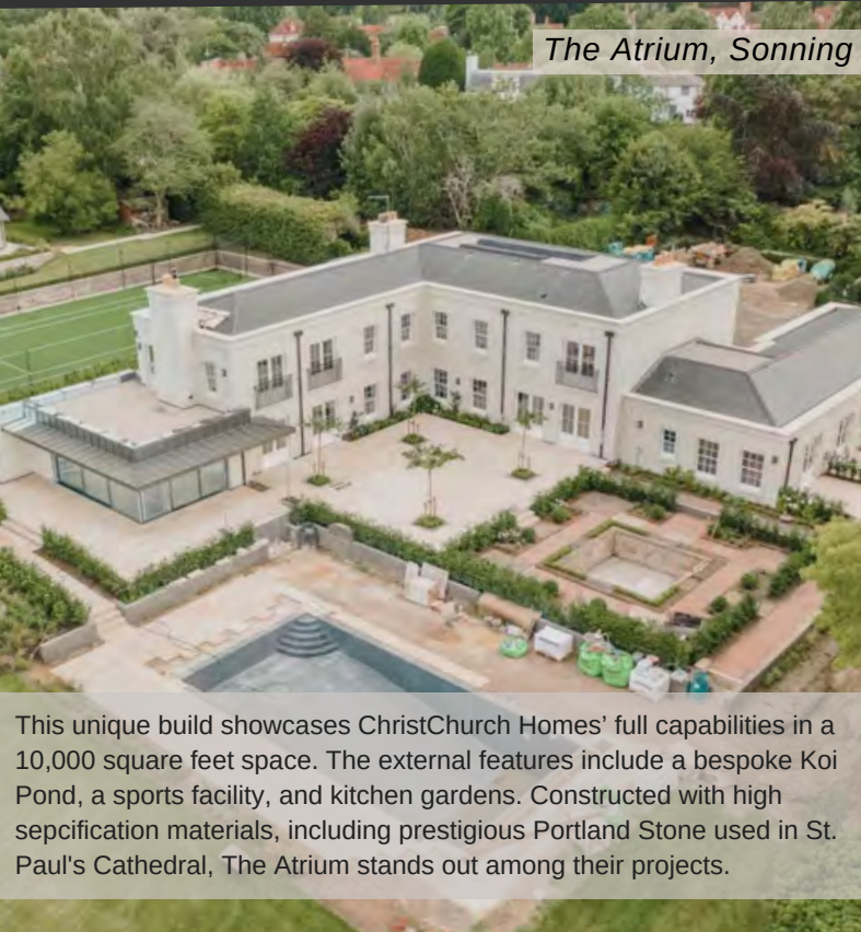
The Atrium, Sonning

This unique build showcases ChristChurch Homes' full capabilities in a 10,000 square feet space. The external features include a bespoke Koi Pond, a sports facility, and kitchen gardens. Constructed with high specification materials, including prestigious Portland Stone used in St. Paul's Cathedral, The Atrium stands out among their projects.