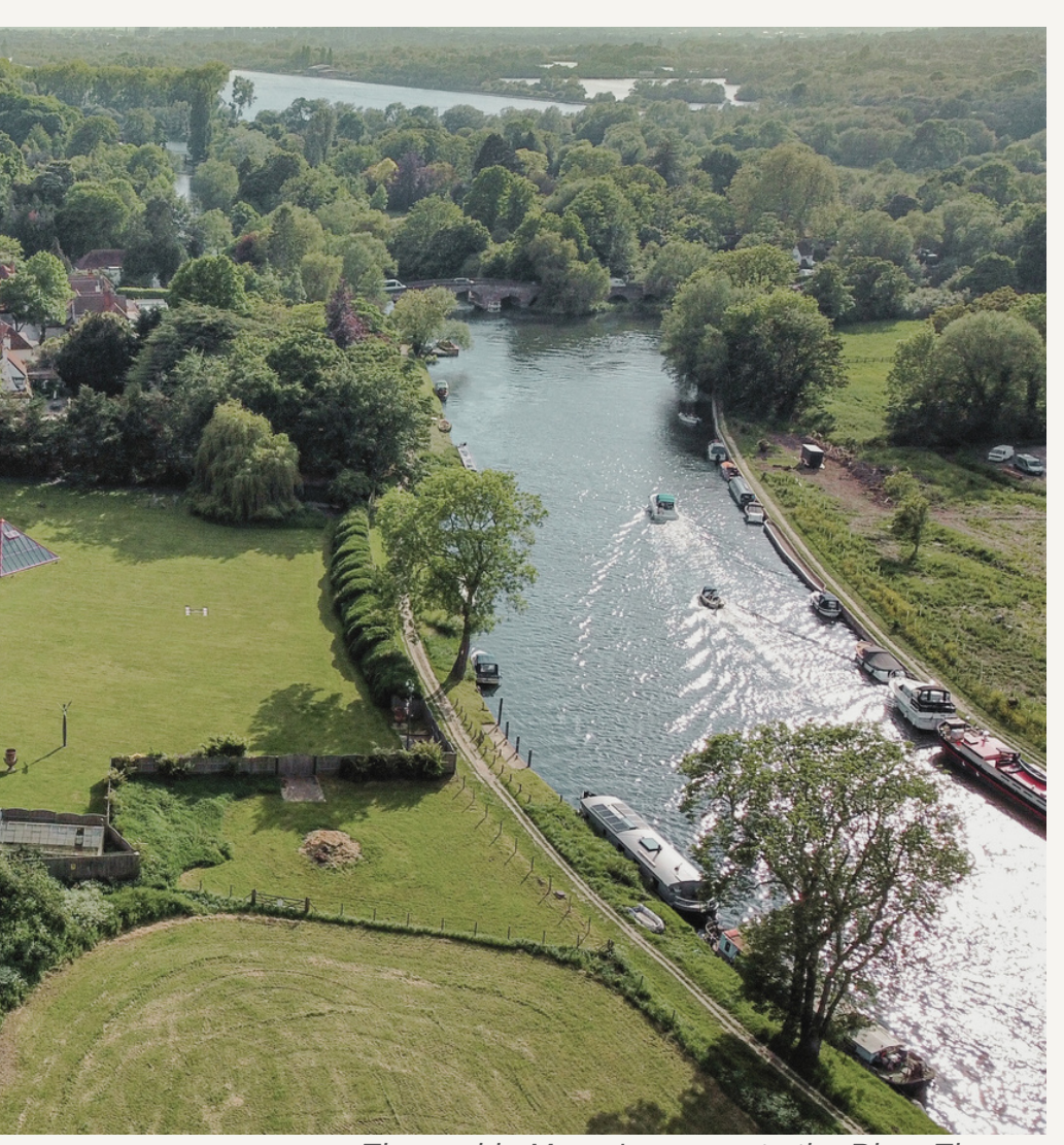
Thameside Manor's access to the River Thames

Located on the Thames River, Sonning is a charming British countryside village in Berkshire, just 45 minutes from London and a quick 15-minute drive to Reading.